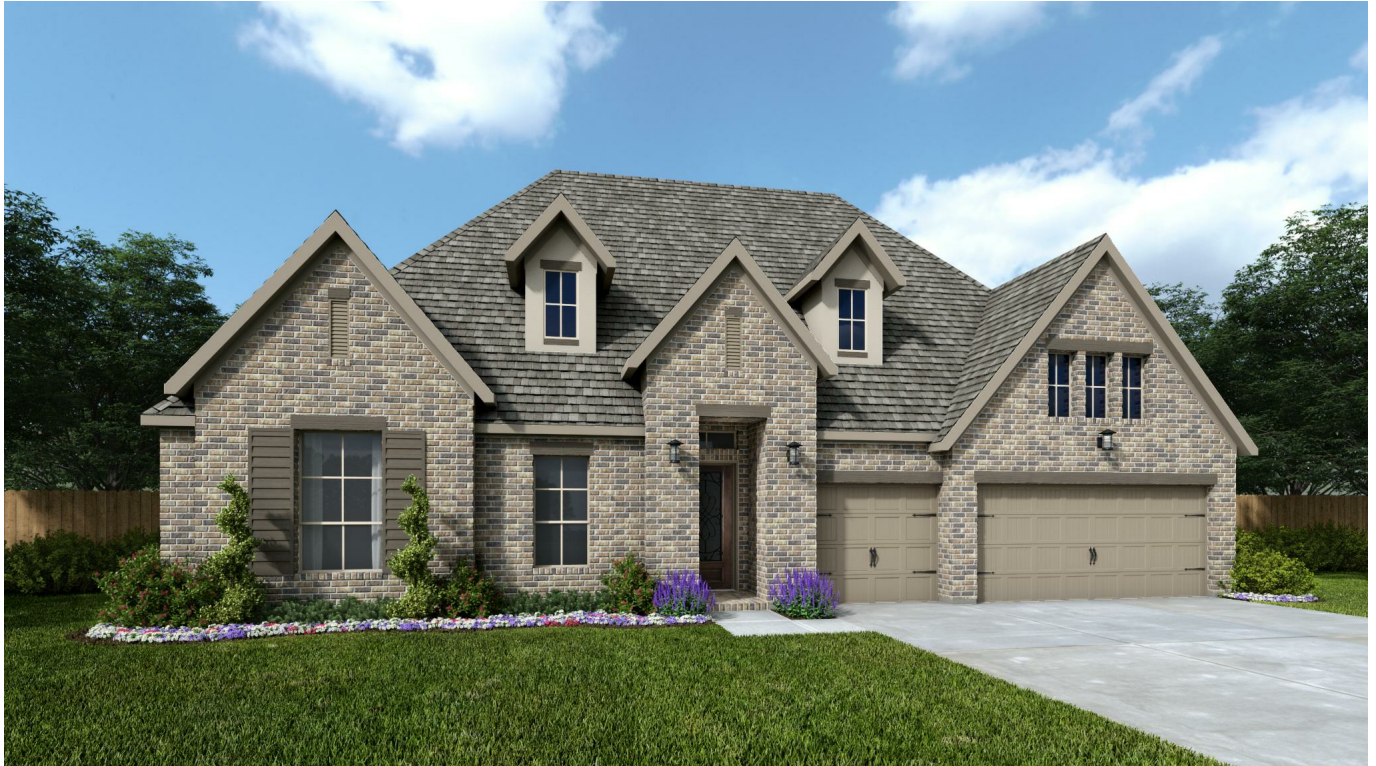
Design 618A E-1