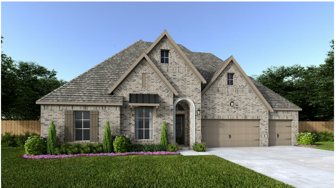
Design 618A E-2