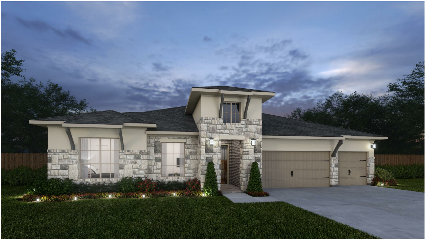
Design 618A E-90