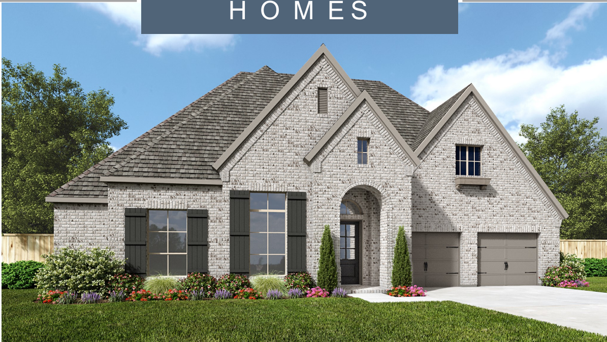
DESIGN 619A E-1