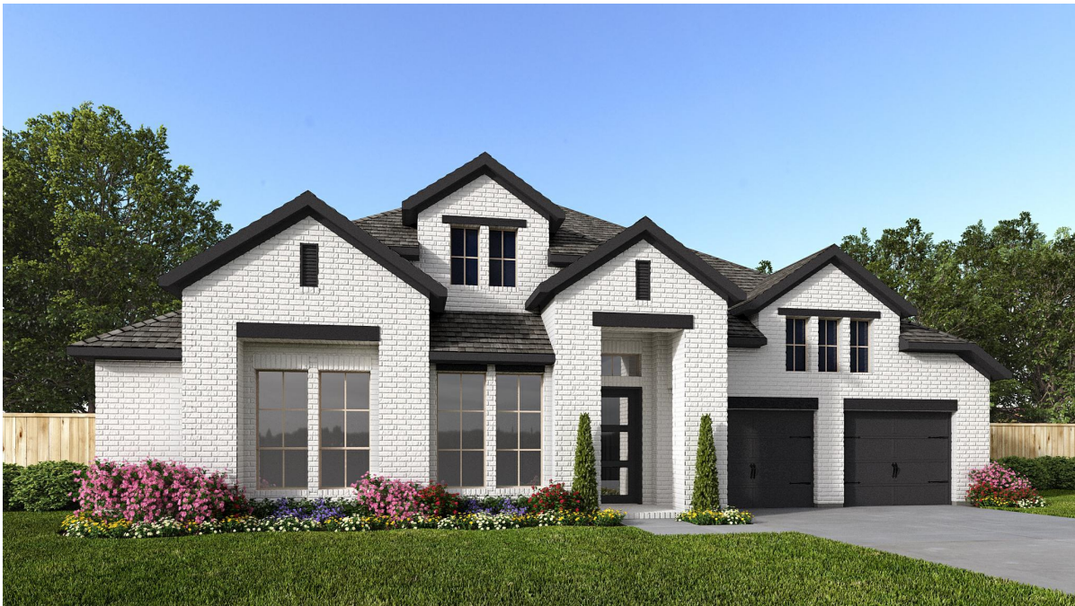
DESIGN 619A E-2