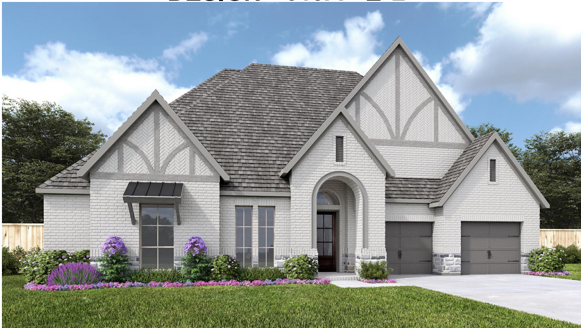
DESIGN 619A E-50