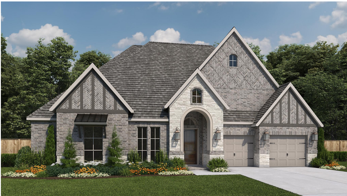
DESIGN 619A E-70