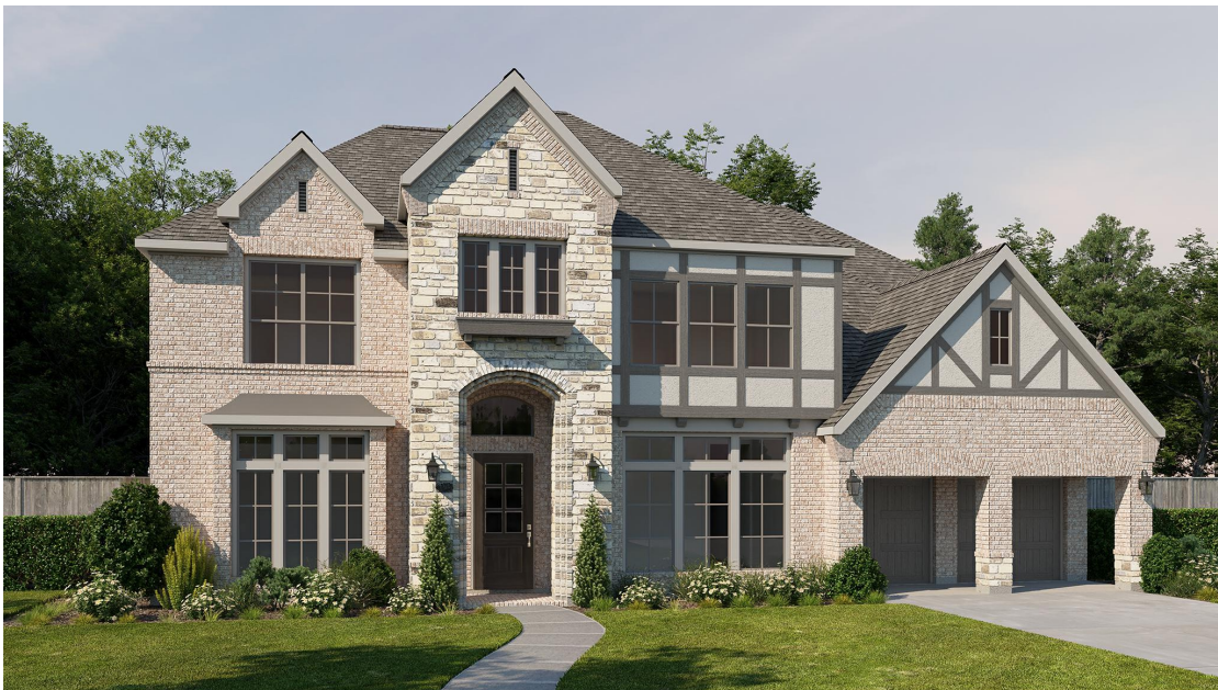
DESIGN 651A E-101