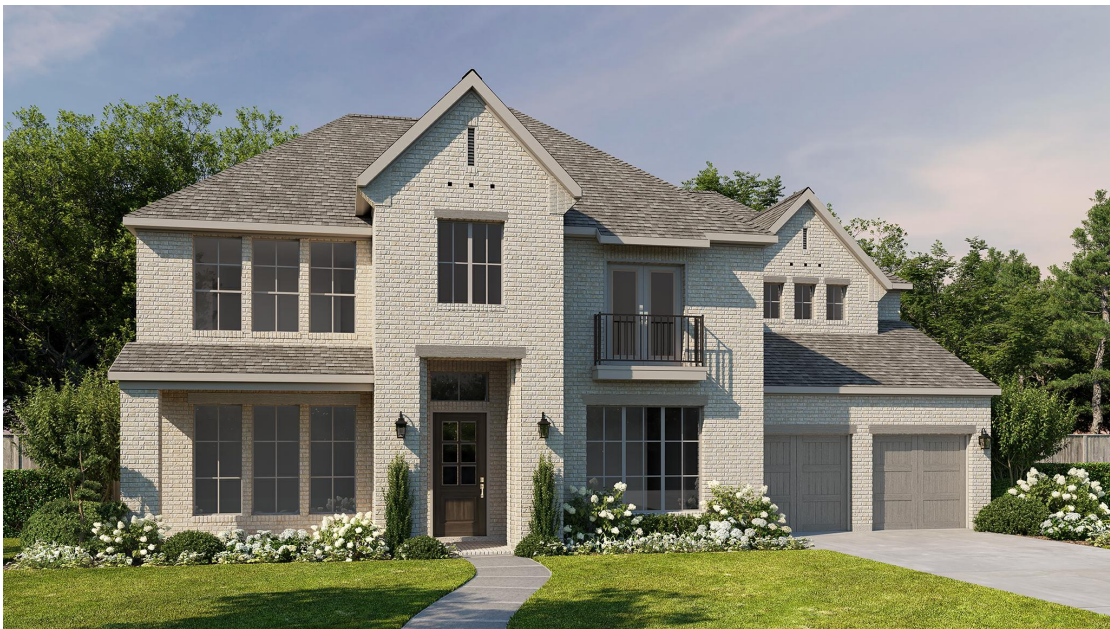
DESIGN 651A E-100