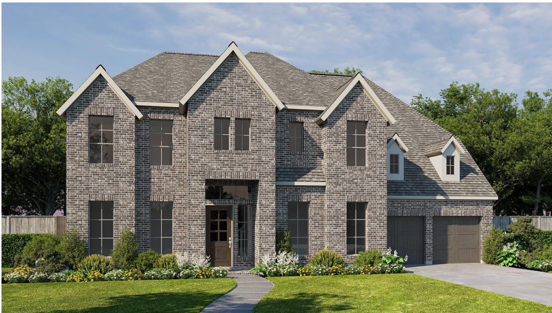
DESIGN 651A E-1