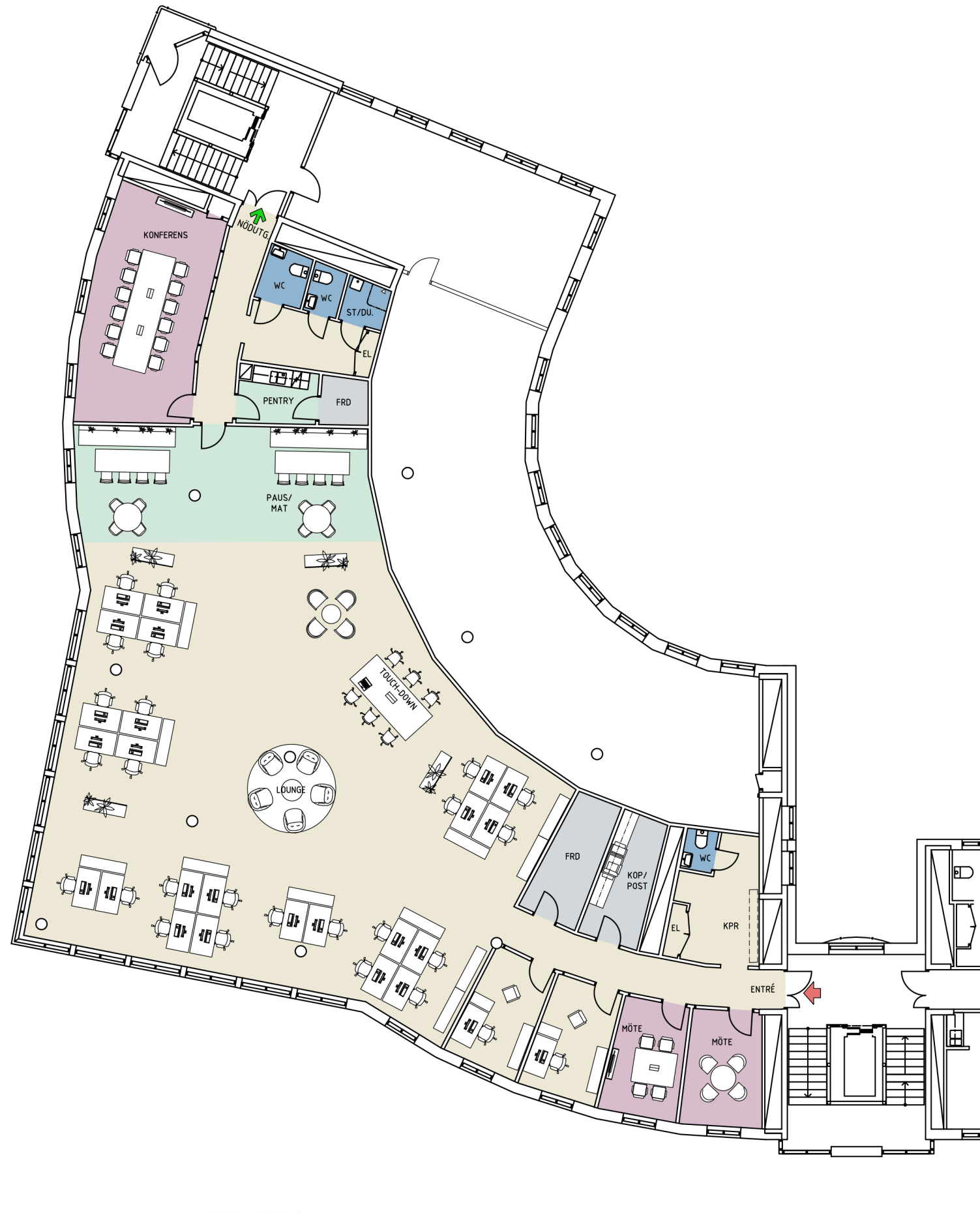
SKALA 1:200-A3 0 1 2 3 4 5 m