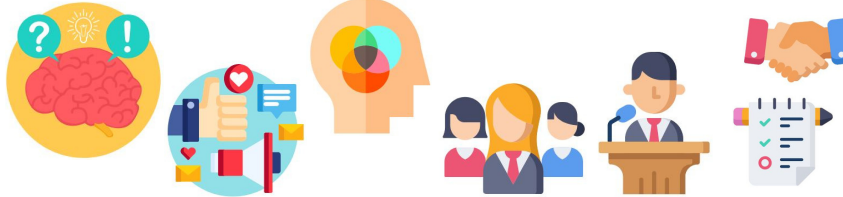
CURIOSITY RESILIENCE TOLERANCE STRESS-MANAGING FLEXIBILITY ORGANIZING MULTITASK PUBLIC SPEAKING