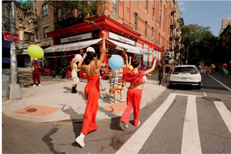
Imitation of Christ, spring 2022 ready-to-wear