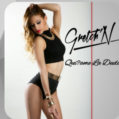
QUITAME LA DUDA 2017