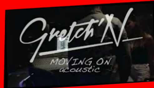
MOVING ON (ACOUSTIC) 2016