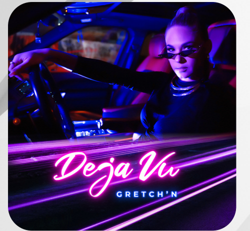
DEJA VU 2023