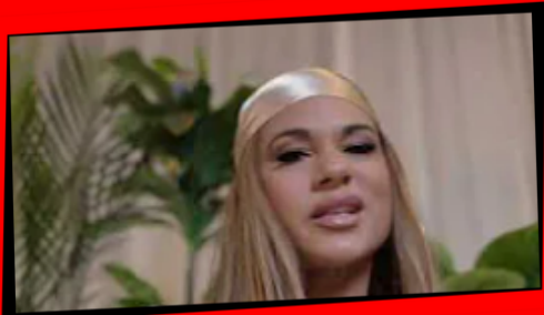
ME GUSTA 2023