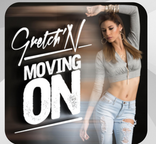
MOVING ON 2016