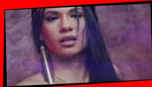
3 DESEOS 2023