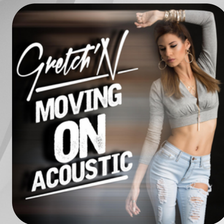
MOVING ON ACOUSTIC 2016