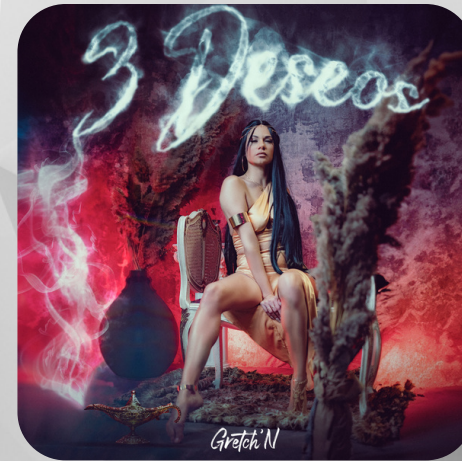
3 DESEOS 2023