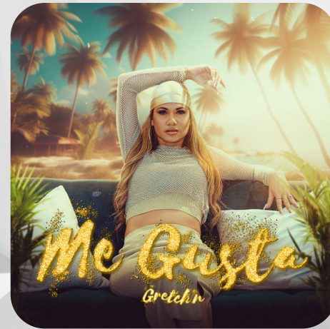
ME GUSTA 2023