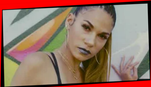
TODO (VISUALIZER) 2020