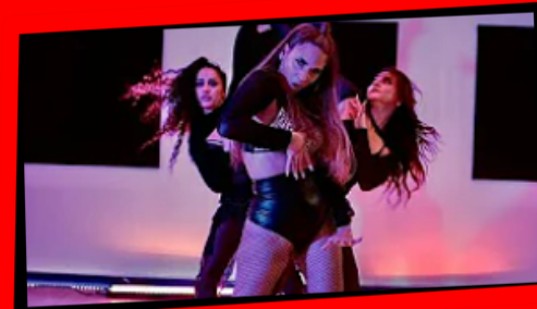
DEJA VU 2023