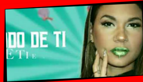
BDM (LYRIC) 2023