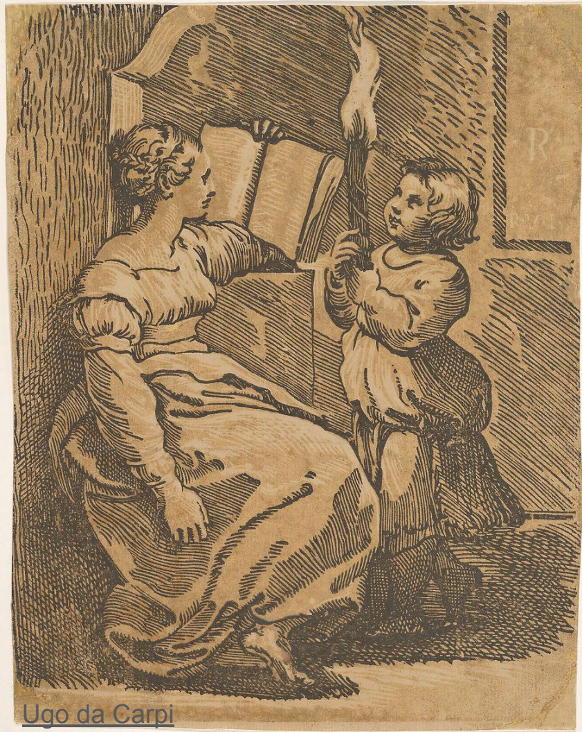
Ugo da Carpi