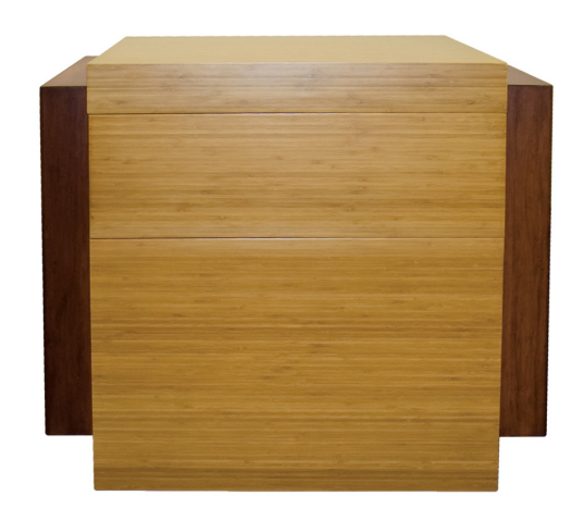
VNS301-Caramel and Woven Strand Bamboo