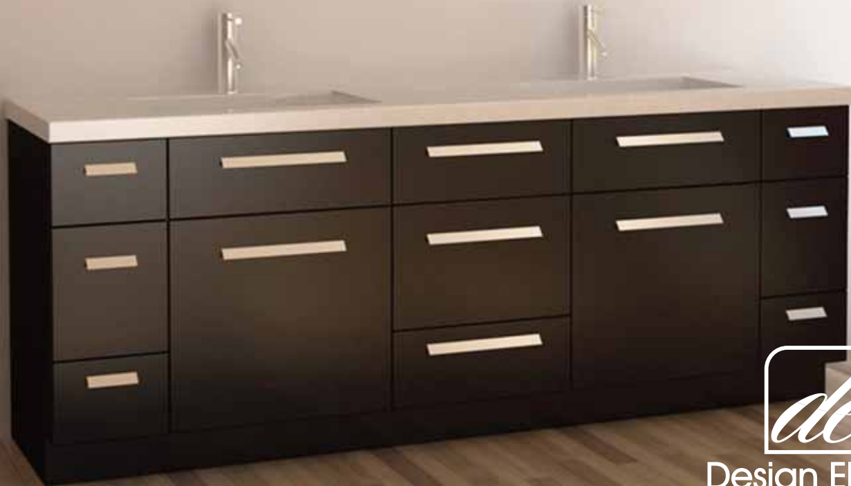
J84-DS Moscony 84" Double Sink Vanity Set (Faucets not included)