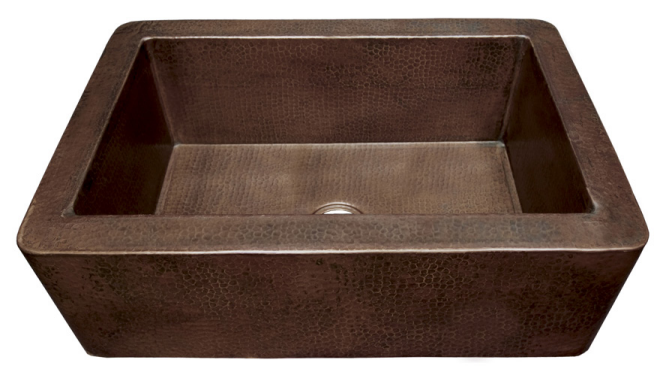
CPS273- Antique CPS573- Brushed Nickel