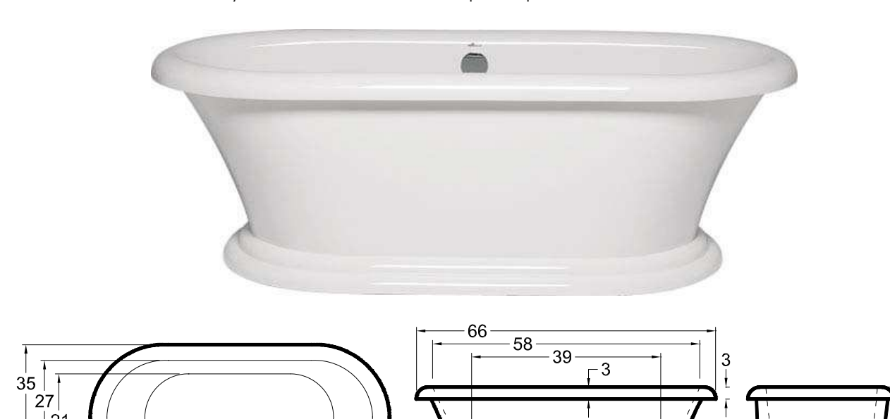
All bathtub dimensions are \pm 1/2 ".

Always check the website for the most updated specifications: www.americh.com