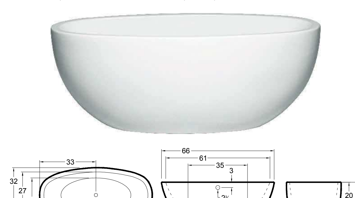
All bathtub dimensions are \pm 1/2 ".

Always check the website for the most updated specifications: www.americh.com