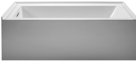
Features integral skirting and tile flange.