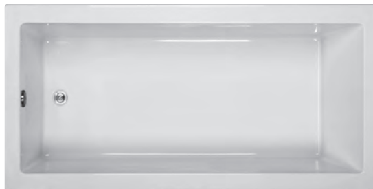
Inside view of tub.