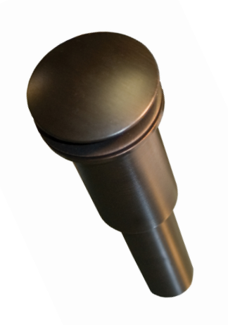
DR120- BN (Brushed Nickel) DR120-ORB (Oil Rubbed Bronze) DR120-WC (Weathered Copper)