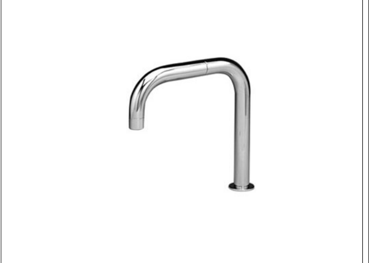
090D 360° double swivel spout. Hole cut out size: 21 mm, max. 29 mm.