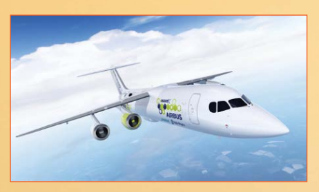
Electric power is already part of the history of the aeronautical industry. Batteries and electric motors have previously been used to power recreational remote control aircraft and are now even used to operate larger unmanned aerial