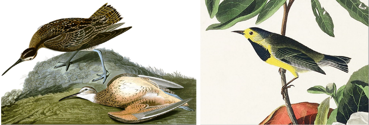
Fig. 2. Extinct but not listed as such, for fear of committing the ‘Romeo Error’. Left: Eskimo curlew ( Numenius borealis (Forster)), from Audubon (1827–1838: plate 208; Wikimedia Commons). Right: Bachman’s warbler ( Vermivora bachmani (Audubon)), from Audubon (1827–1838: plate 185 (detail); Creative Commons, Rawpixel).