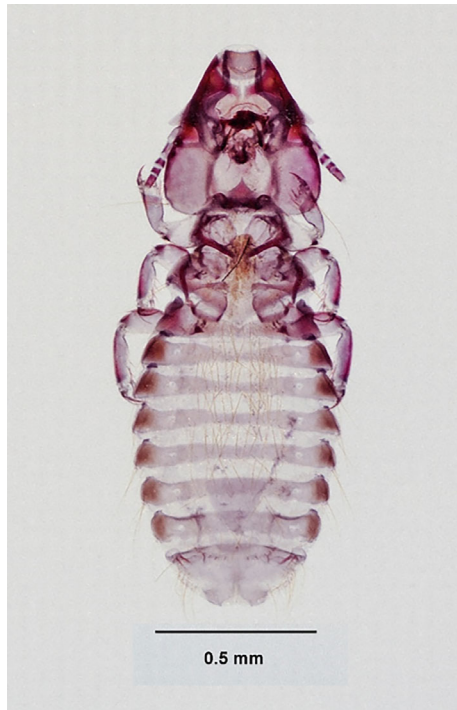
Fig. 3. Parasites, such as this louse (Phthiraptera, Rallicola pilgrimi Clay, collected June 2014, South Island, New Zealand), which went extinct when its host, the little spotted kiwi ( Apteryx owenii Gould), was transferred to predator-free islands (Buckley et al. , 2012), and which is not on the Red List , are almost completely unknown in the assessment of extinctions.

as a whole, based on Red List data, perhaps because higher vagility and concomitant larger range sizes reduce extinction risk in these highly volant groups.