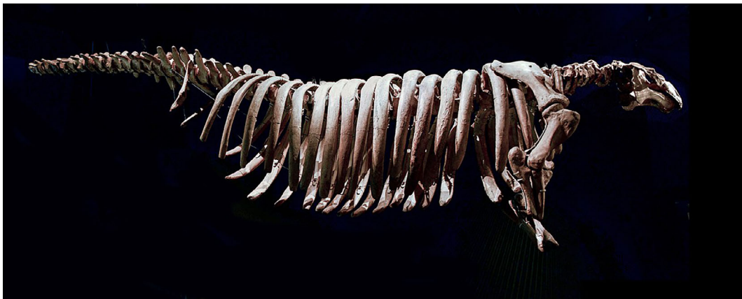
Fig. 7. Steller’s sea cow ( Hydrodamalis gigas (Zimmerman)), one of the few documented marine extinctions, skeleton in the Musée des Confluences, Lyon.

We agree with Roberts & Hawkins (1999, p. 245) that “what is now beyond doubt is that many marine species have