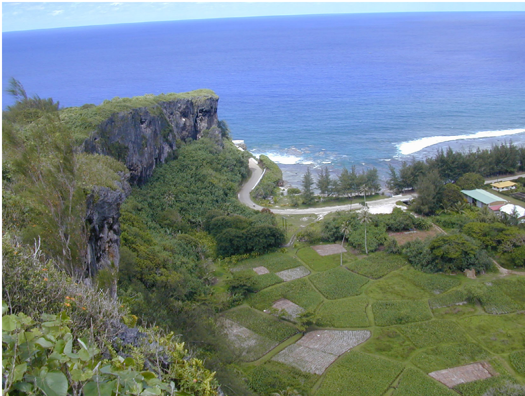
Fig. 5. Rurutu (Austral Islands, French Polynesia) was once home to 19 species of endemic Endodontidae (Mollusca). Despite extensive searches in the remaining patches of native vegetation, such as at the foot of this cliff, only empty shells were found. All 19 species are now considered extinct.

Our most recent numbers (Cowie et al. , 2017) are 638 species extinct, 380 possibly extinct, and 14 extinct in the wild, a total of 1,032 species in these combined categories, and more than twice as many as listed by IUCN (2020) in these categories (462). Furthermore, based on expert assessment of a rigorously random global sample of 200 land snail species (Régnier et al. , 2015a), extrapolation estimated that of the