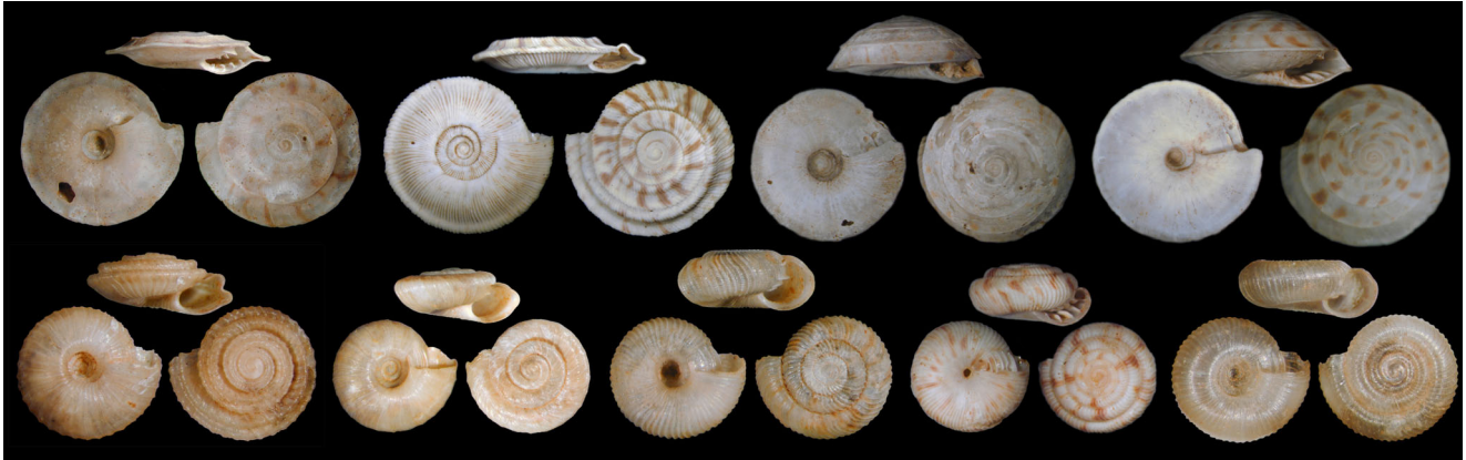
Fig. 4. Recently extinct Endodontidae from Rurutu (Austral Islands, French Polynesia).