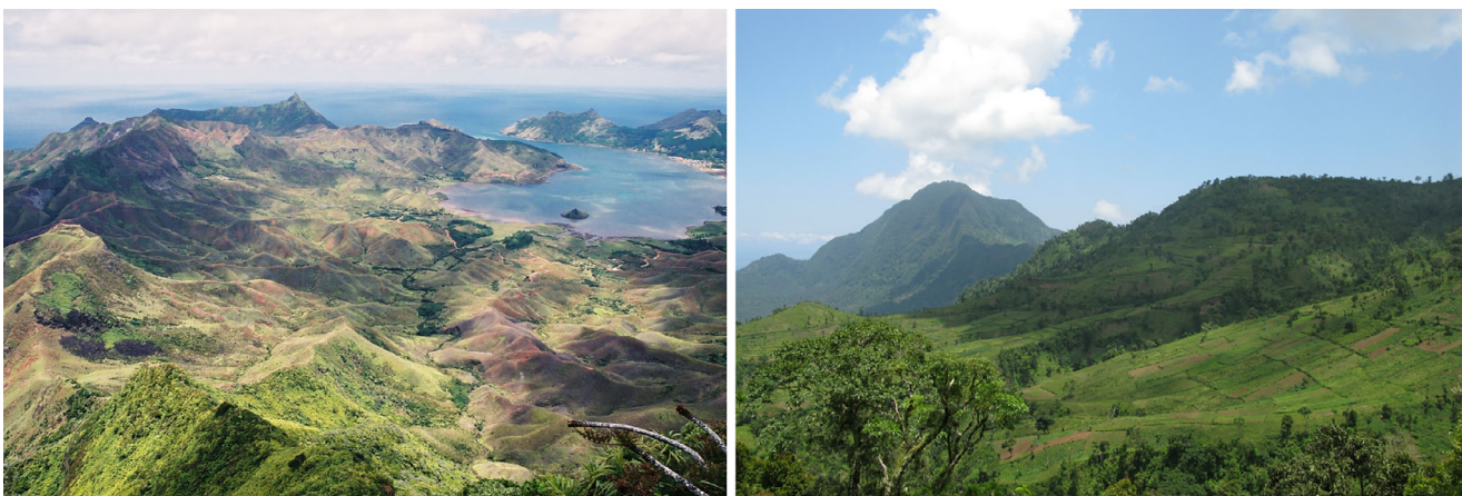
Fig. 6. Right: Tropical islands such as Anjouan in the Comoros, have suffered extensive deforestation for agriculture. Native vegetation is generally completely lacking at lower altitudes, and the highest ridges and mountaintops are now the last refuges of the remaining extant endemic species. Left: Other islands such as Rapa in the Austral Islands, French Polynesia, which has an area of only 40 km 2 and used to have more than 100 endemic land snail species, 59 endemic plant species and 67 endemic weevil species, are now mostly barren. Fires and overgrazing by introduced herbivores have destroyed much of the upper elevation habitat, and the vegetation at lower altitudes is dominated by invasive species.

Environmental health of the oceans is the subject of considerable media attention, that to a large extent tends to treat pollution (e.g. the “seventh continent” of plastic; Ter Halle & Perez, 2020), the collapse of fisheries, and extinction as