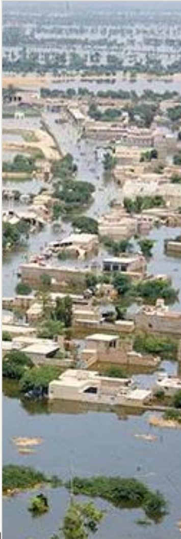
Many villages are under water in Sindh Province.