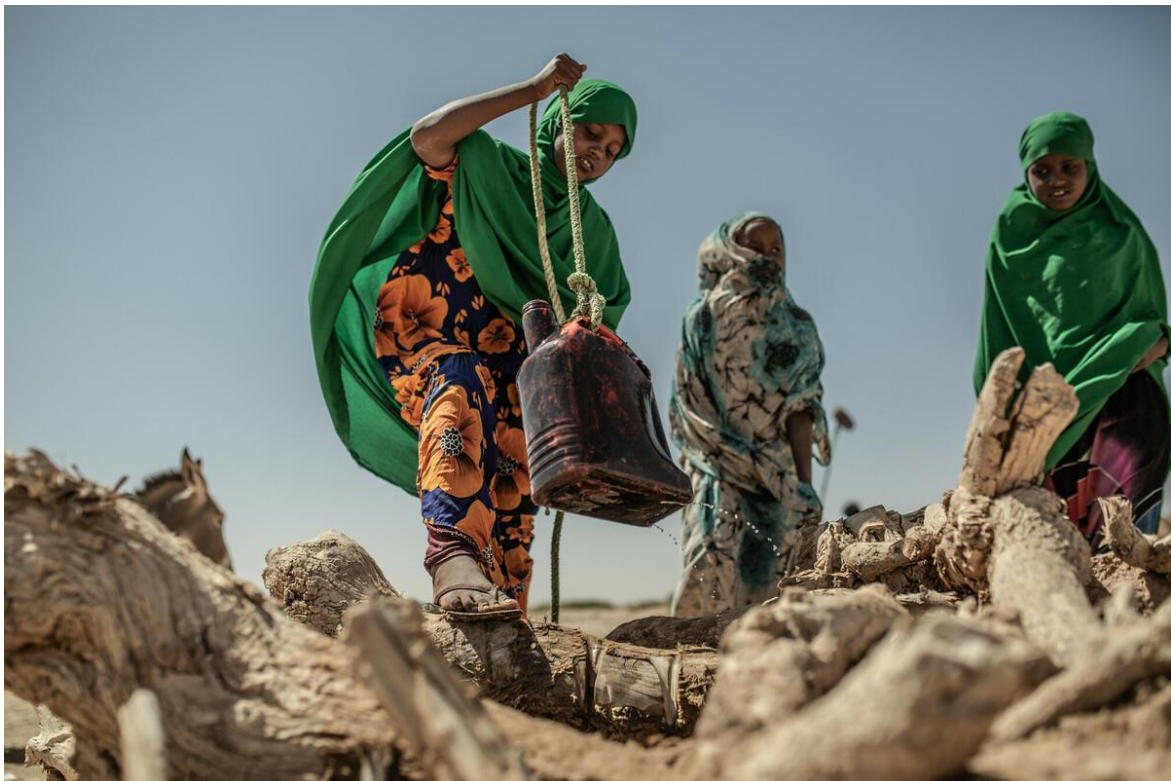
Women and girls often walk long distances to fetch water during droughts. Somali girls collect water from a well in Docoloha village, Somaliland.

Deep existing inequalities mean that small-scale producers, who produce more than 70% of the food consumed for people living in Asia and sub-Saharan Africa 65 , and the more than 1.7 billion people working on farms, plantations, fishing boats and in processing factories 66 , are often unable to produce enough food, or earn enough income, to escape hunger and poverty.