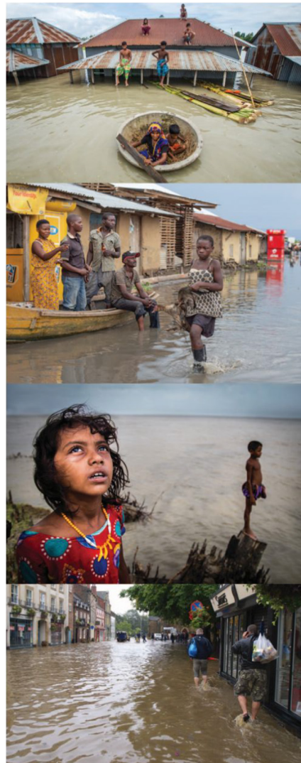
Figure 1. The impacts of climate-related droughts (left column) and floods (right column). Left column (top to bottom): “Children in dust storm” (Ethiopia, 2016; photograph: Anouk Delafortrie/EU/ECHO), a water hole that may have become empty because of drought (Mozambique, 2016; photograph: Aurélie Marrier d’Unienville/IFRC), drought-affected corn field in Paulding County, Ohio (United States, 2012; photograph: US Department of Agriculture/Christina Reed), “Drought in Kenya’s Ewaso Ngiro river basin” (Kenya, 2017; photograph: Denis Onyodi/Denis Onyodi/KRCS). Right column (top to bottom): houses are nearly submerged by flooding (Bangladesh, 2020; photograph: Moniruzzaman Sazal/Climate Visuals Countdown), “A girl, duck in hand wades through the water in Rwangara” (Uganda, 2020; photograph: Climate Centre), “two children a boy and a girl on a flooded riverbank” (Bangladesh, 2018; photograph: Moniruzzaman Sazal/Climate Visuals Countdown), “Residents wade through flooded streets to escape flood waters” (United Kingdom, 2008; John Dal). All photos are licensed under Creative Commons and all quotes are from the Climate Visuals project ( https://climatevisuals.org ). See supplemental file S1 for details and more pictures.

especially in low-income areas that are most vulnerable to climate impacts. More generally, other policy instruments could include investments in innovation and climate finance (supplemental figure S5), positive subsidies, and feed-in tariffs that guarantee an above-market price for renewable energy producers.