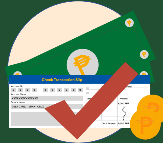
Proof of payment

Submit the additional investment and proof of payment to transactions@rampver.com for validation and processing.