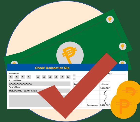
Proof of payment

Submit the subscription transaction form and proof of payment to transactions@rampver.com for validation and processing.