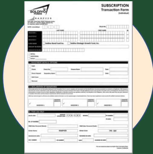
Subscription Transaction Form