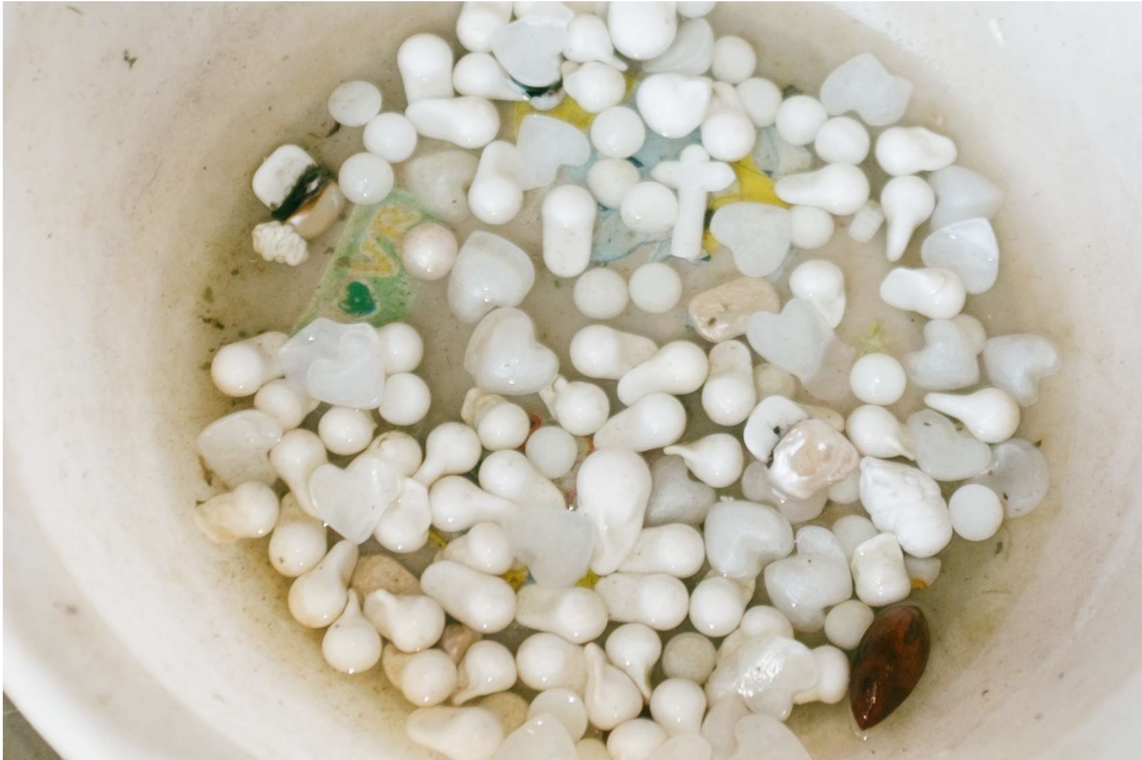
The Inner Nucleus of the Pearl