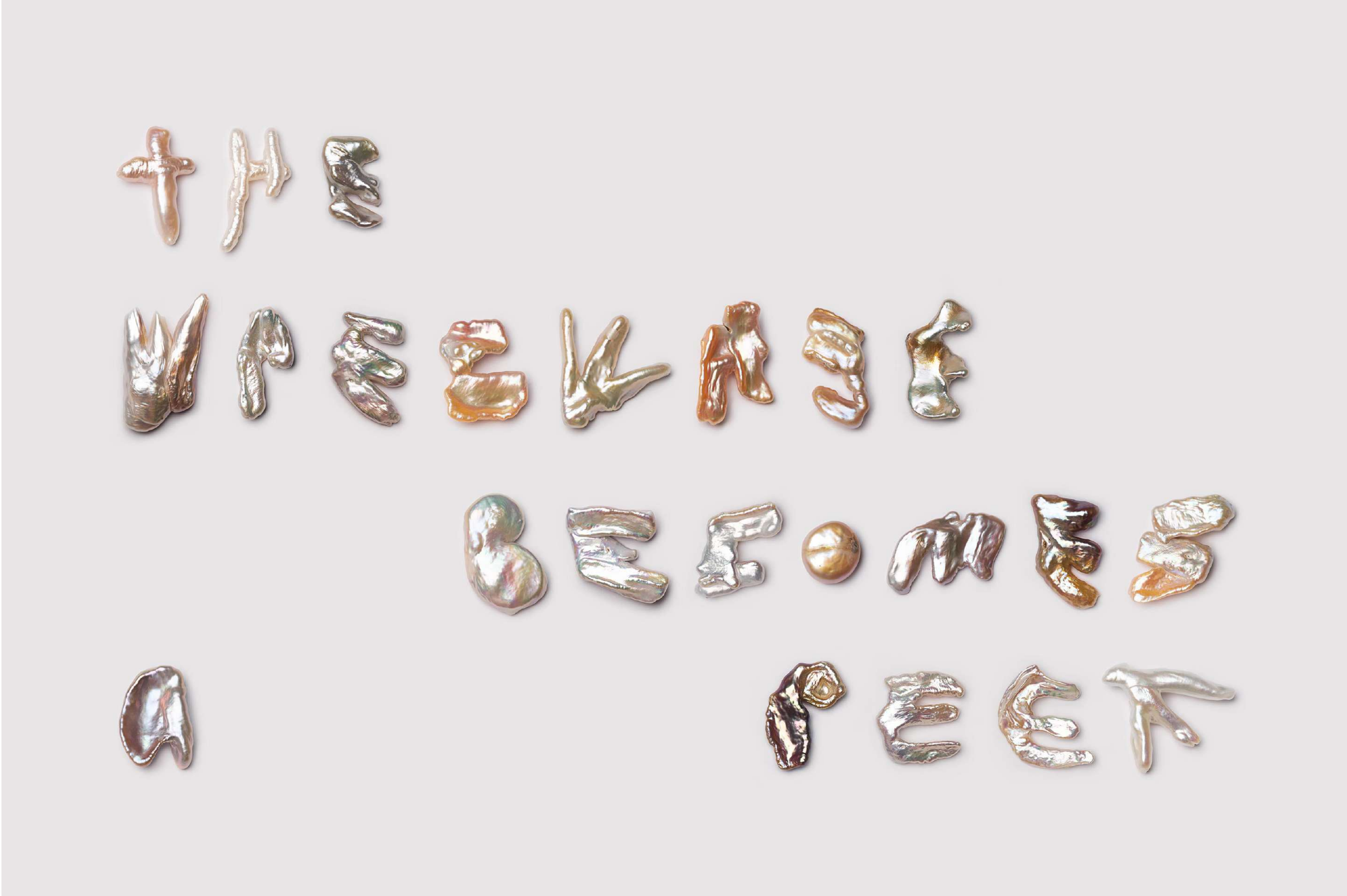
The Wreckage Becomes A Reef

Unrefined Misshapen Pearls, Photography, 180x110cm, 3 Editions + 1 AP, 2023