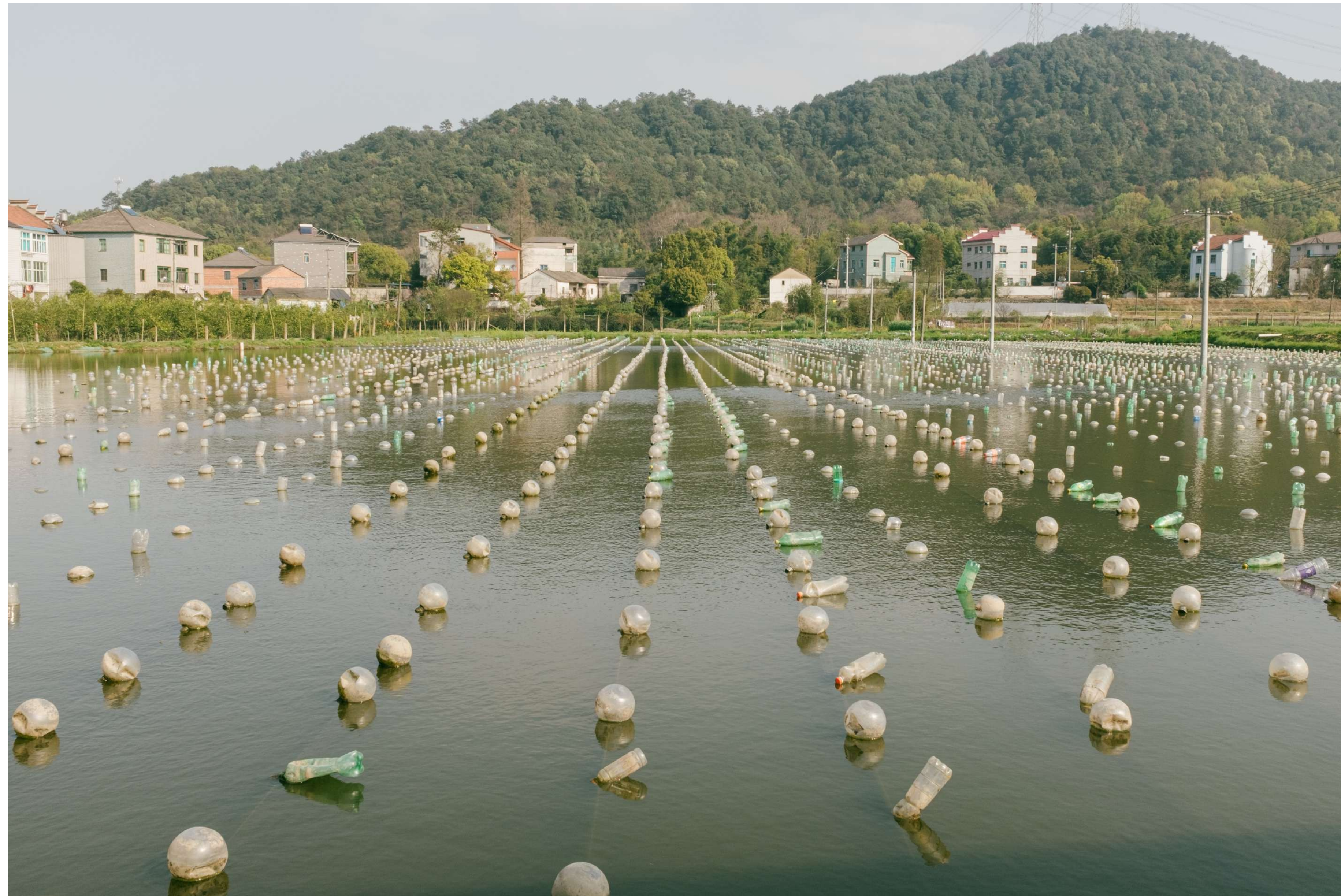
The Pearl Pond

I collected the misshapen unrefined pearls in alphabetic shapes from the second hand market to spell the words, secrets, confessions that are hard to speak out through language.