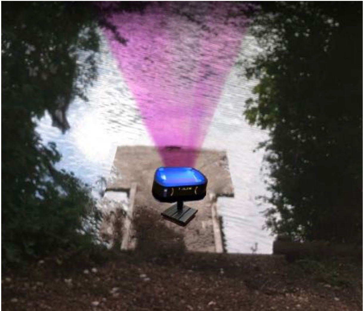
Mock up of a projector sited on an angler jetty