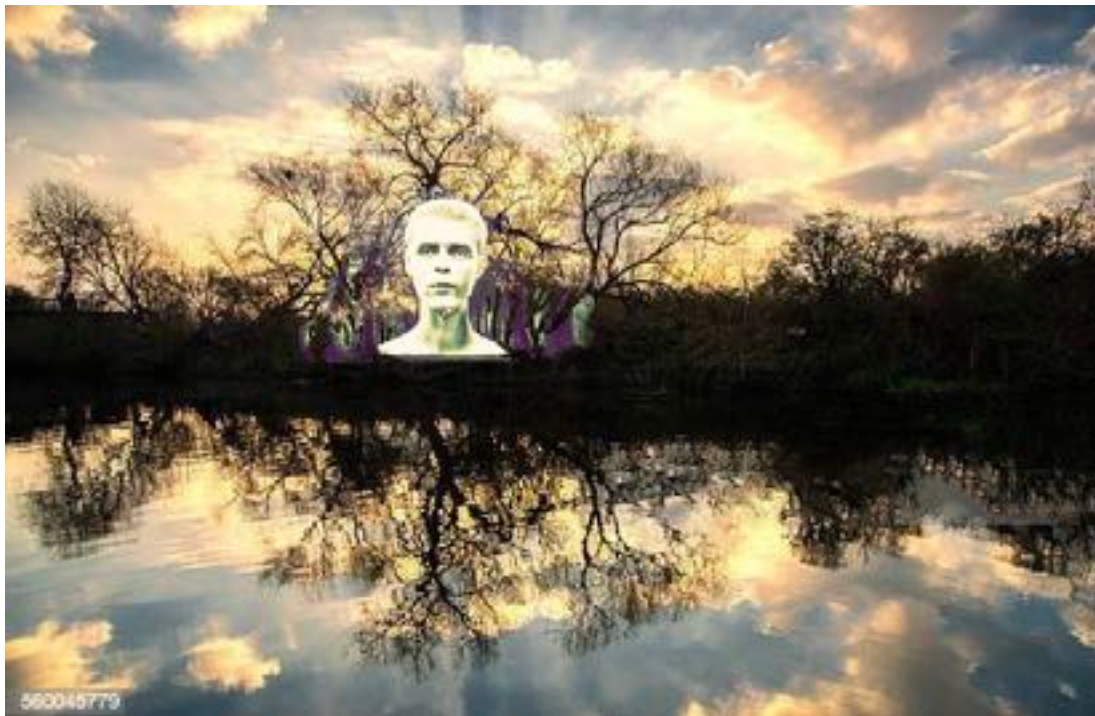
View from pathway between reservoir 1 and 2