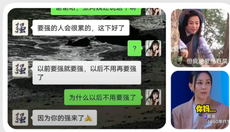
Collection 2(79) Created on 02/01/2024