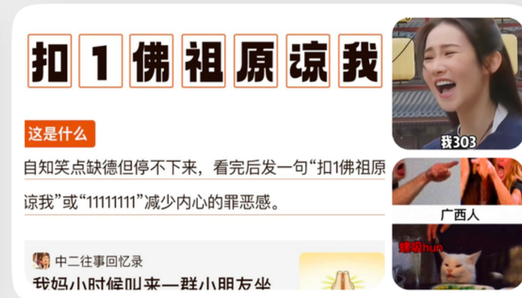
Collection 3(97) Created on 24/02/2023