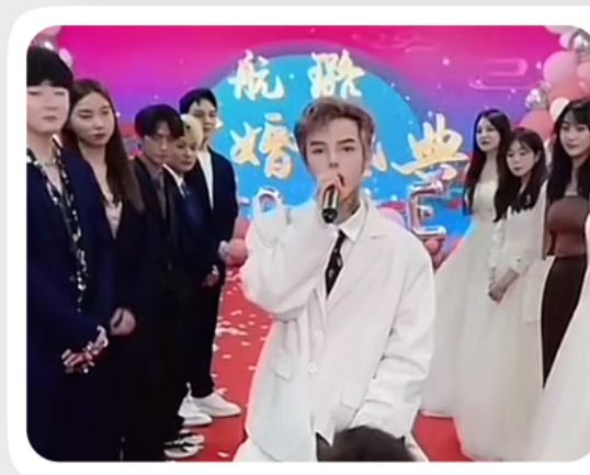
Collection 1(15) Created on 09/03/2024