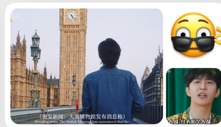
Collection 3(97) Created on 24/02/2023