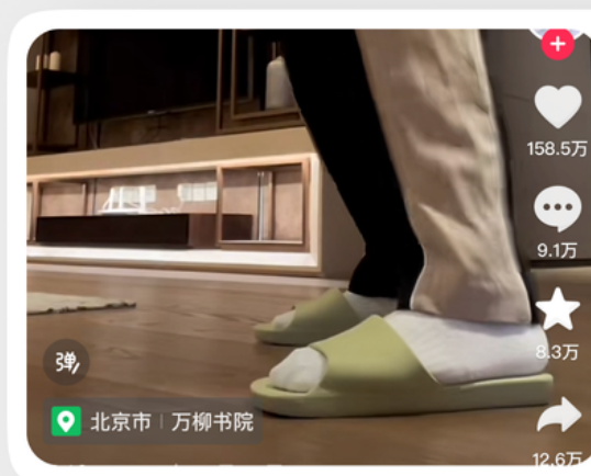
Collection 1(15) Created on 09/03/2024