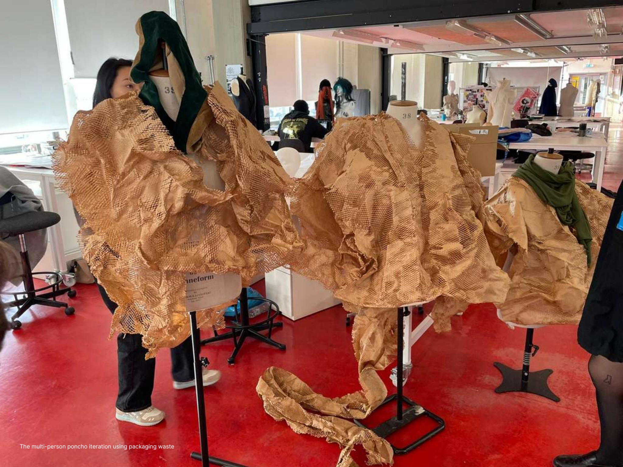
The multi-person poncho iteration using packaging waste