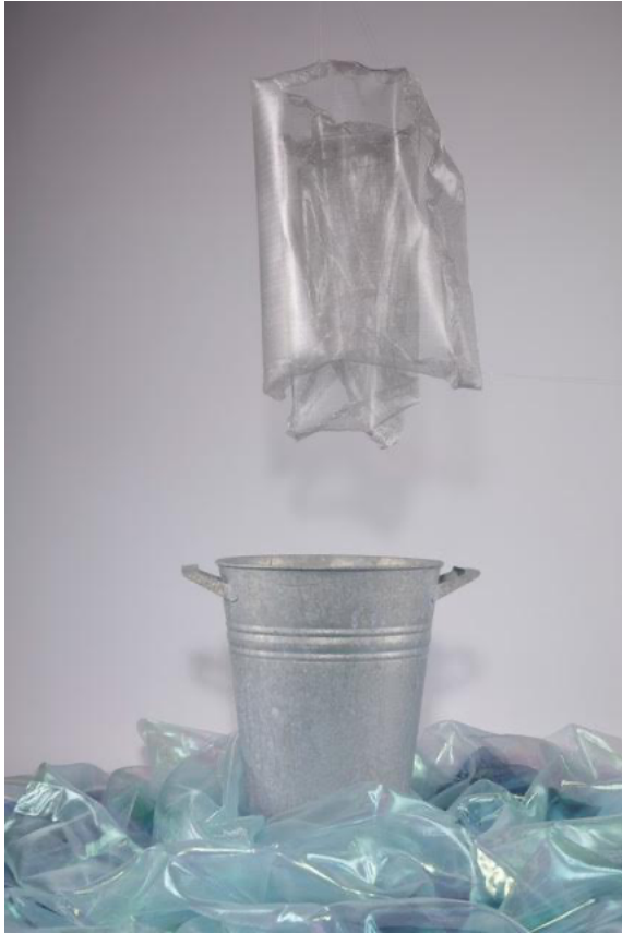
Beverley Harrison Iceberg , 2024 wire mesh, florist bucket, 13" x 19"