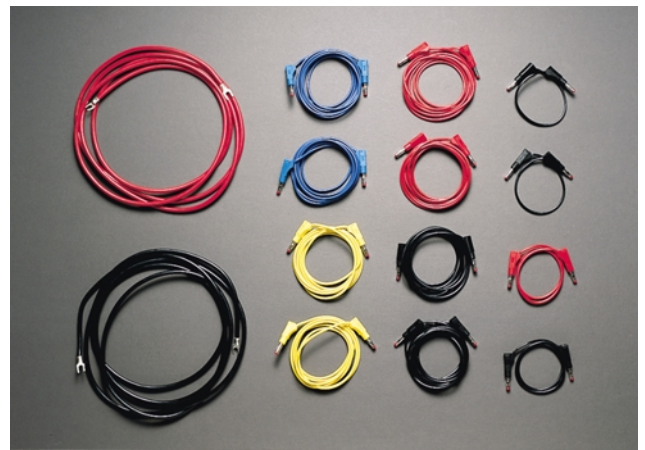
Test lead set