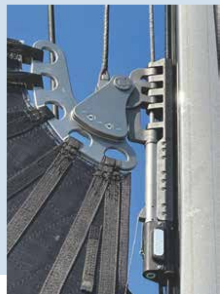
Left: Launch of Gelliceaux / Right: RP Locking HB Car