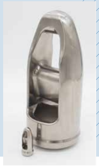
Image right: Little and large - a 2.5T and 60T forward lock bullet