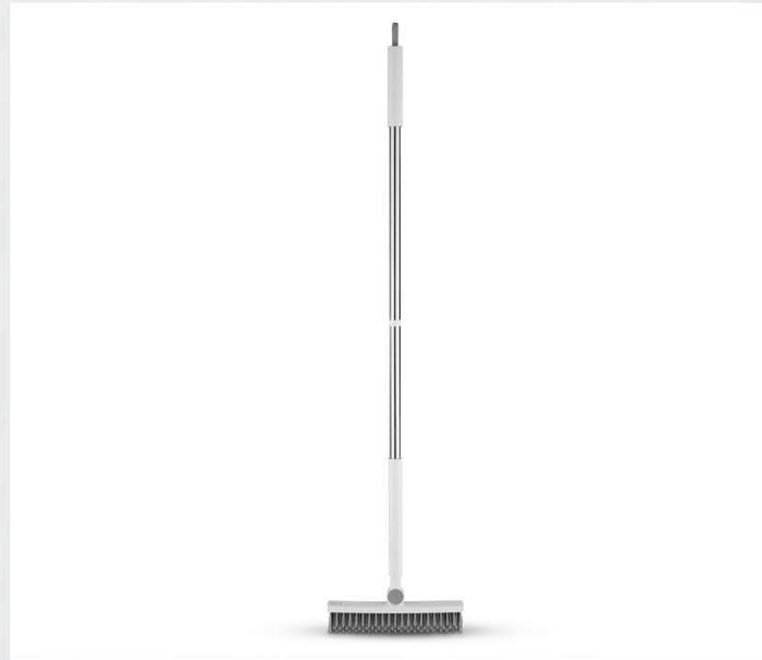
SWFC2007WHTN PRECISION ANGLED SCRUB BRUSH WITH SQUEEGEE