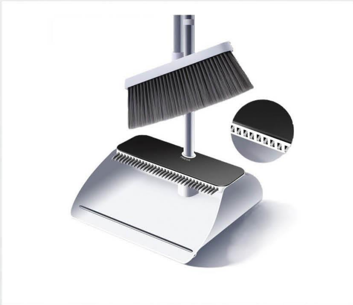
SWFC2006WHTN LONG HANDLED DUSTPAN AND BRUSH