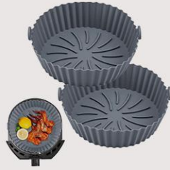
2 Piece Silicone Air Fryer Liners £5.99

Whilst some of our competitors sell similar accessories at a lower price, Tower Air Fryer Accessories are sturdier and carefully constructed from a thicker material to avoid spillages and keep the air fryer clean. The versatile design ensures customers have a wide array of meal choices available to them, so they can create pasta bakes and one pan meals in their air fryer to save time in the kitchen.