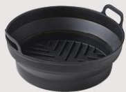
T843090 1.2L Perfect Fit Round Foldable Silicone Trays