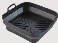
T843092 2.5L Perfect Fit Square Foldable Silicone Trays