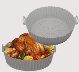
Silicone Air Fryer Liners £6.99

Tower offers the consumer real value for money when compared to the traditional market leading brands.