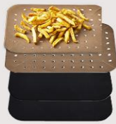
TLINER3 Set of 4 Rectangular Reusable Dual Basket Air Fryer Liners 9 LITRE