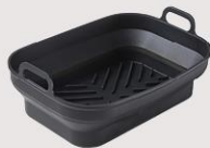
T843091 1.3L Perfect Fit Rectangular Foldable Silicone Trays