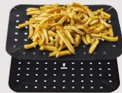
TLINER6 Set of 2 Rectangular Reusable Dual Basket Air Fryer Liners 9 LITRE