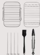
T843096 8 Piece Air Fryer Accessories Set