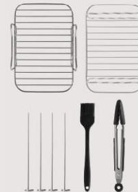
T843096 8 Piece Air Fryer Accessories Set