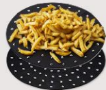
TLINER5 Set of 2 Circular Reusable Air Fryer Liners 5-7 LITRE