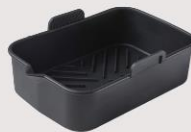
T843093 1.5L Perfect Fit Rectangular Solid Silicone Trays