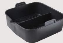
T843095 2.5L Perfect Fit Square Solid Silicone Tray With Divider