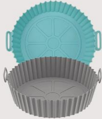
BazTechElectroS Air Fryer Silicone Pot £4.49