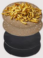
TLINER2 Set of 4 Circular Reusable Air Fryer Liners 5-7 LITRE