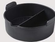
T843094 1.3L Perfect Fit Round Solid Silicone Tray With Divider