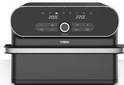
11 LITRE DUAL BASKET + FLEXI