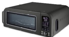
T17141 Pizza Oven & Air Fryer