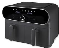
T17138 10.4 Litre Dual Basket Air Fryer