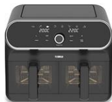
T17195 Vortex 8L Dual Basket Air Fryer with Windows