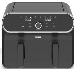
8 LITRE DUAL BASKET

The range will offer a consistent and recognisable design across the full collection further strengthening Tower's brand identity in the air fryer market. This also allows consumers to easily upgrade or choose different sizes while maintaining a familiar look and feel.