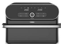
T17200 Vortex 11L Flexi Draw Air Fryer