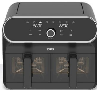
8 LITRE DUAL BASKET + WINDOW