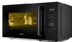
T17133 26 Litre AirWave 2-in-1 Air Fryer & Microwave