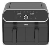
T17194 Vortex 8L Dual Basket Air Fryer