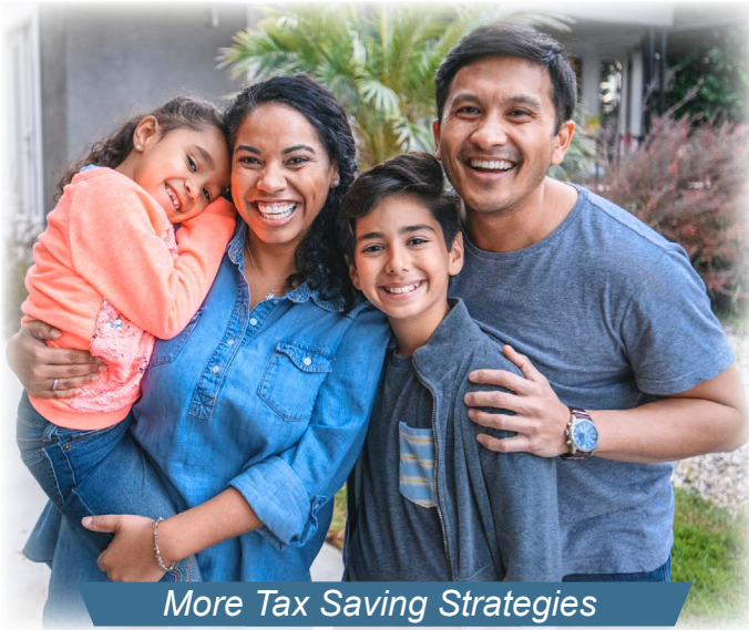
More Tax Saving Strategies

Be sure to contact us before the end of the year if you have questions about your situation. We can help you determine if accelerating or deferring your income can provide tax benefits.