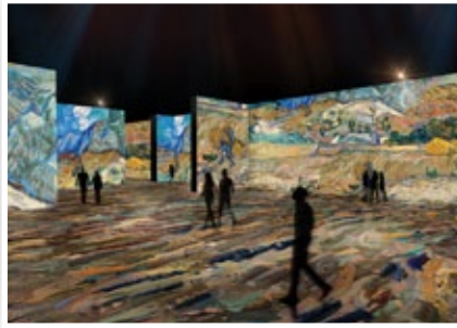
Rendering of THE LUME Indianapolis