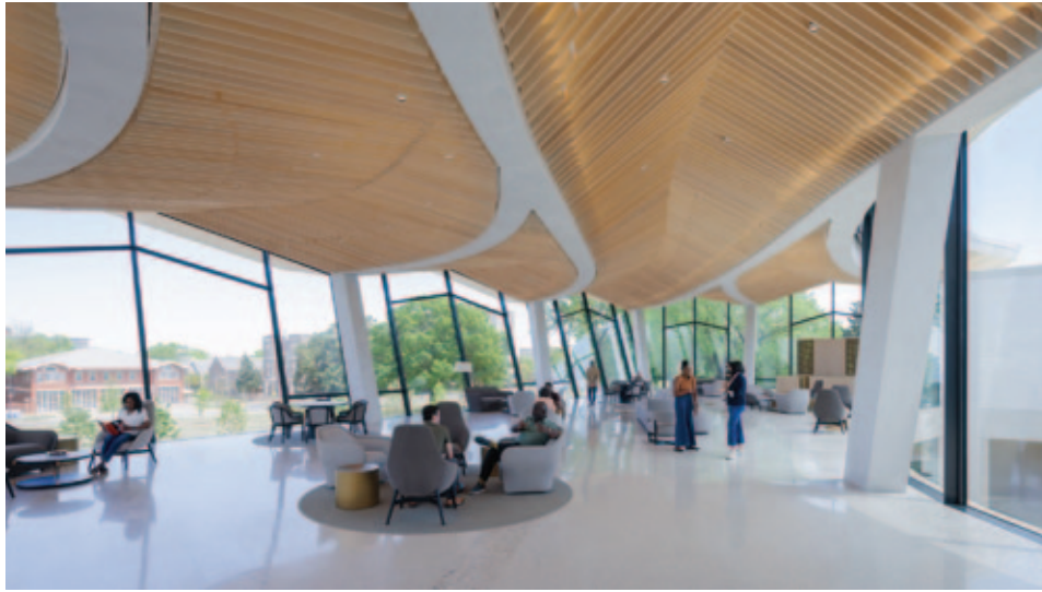
The new Cultural Living Room at the Arkansas Museum of Fine Arts.