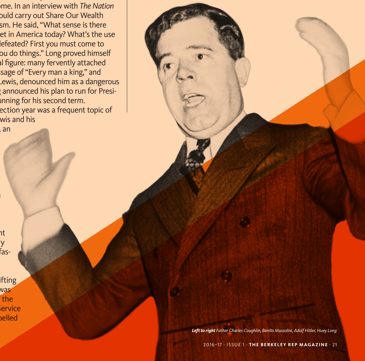
Left to right Father Charles Coughlin, Benito Mussolini, Adolf Hitler, Huey Long