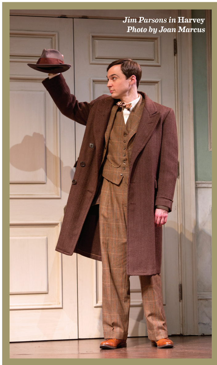
Jim Parsons in Harvey

Along with the impact of the war, the original audience for Harvey experienced technological changes unlike any generation before. By the mid-1940s, Americans had become accustomed to relatively new innovations like the telephone, the automobile, and the airplane. In Hollywood, the technology of cinema had already taken audiences to technicolor, fantasy worlds like The Wizard of Oz . Around the world, industrial production was being used on a greater scale than ever before – and in Europe, it was being used towards vastly destructive ends. Chase was creating a magical character for the American stage in a modern age.