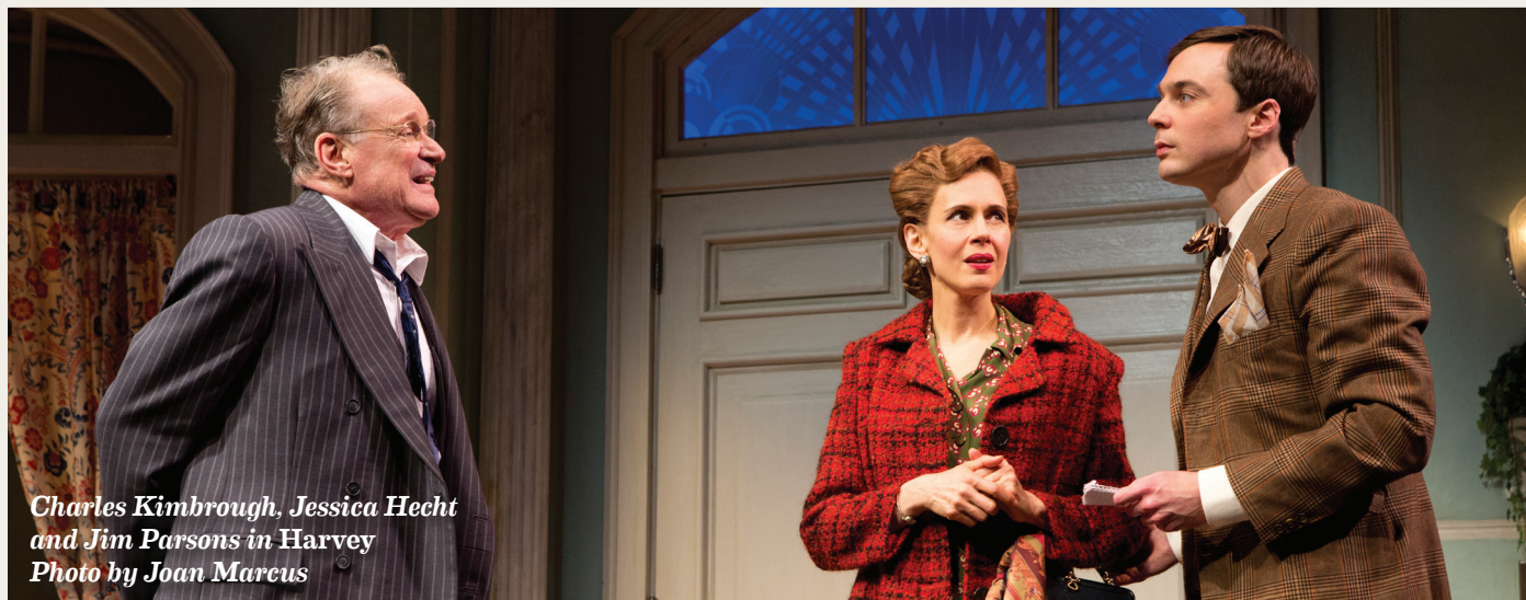
Charles Kimbrough, Jessica Hecht and Jim Parsons in Harvey

Harvey is escapism at its best, overflowing with charm, humor, and even a bit of magic. The play explores the joys of living simply, of making friends, and of finding happiness through taking a leap of faith. Harvey tells a story in which one man tries to be the best person he can be, and watching his journey is sweet, funny, and utterly uplifting. Perhaps that's why this play continues to delight – we get to see a man befriend his own happiness incarnate, in the form of a six-foot-tall rabbit. What could be better than that?