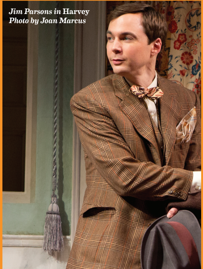
Jim Parsons in Harvey

Ensemble Theatre. It was very little money, but it was hugely important to me to be thrust into a working environment and to meet so many working actors. It made me feel like I was on the right path and running in the right company. From there my career started moving into different directions: I started doing commercials and I did a couple of regional theatre shows at La Jolla Playhouse and did a couple of smaller parts in independent movies. One of them was Garden State , which was seen by a lot of people and, again, that was just fortunate. Then I started booking a lot of pilots for television and some didn't get picked up and then one of them did, and that brings us to today.