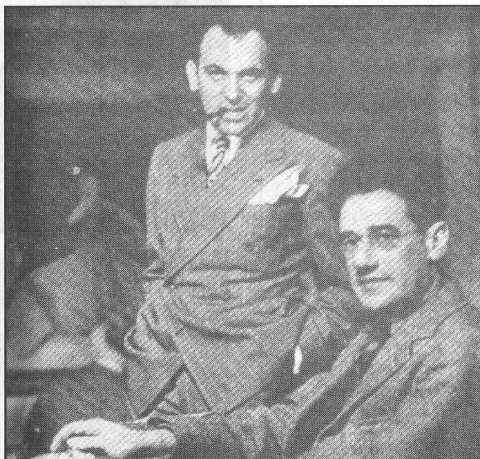
Moss Hart (standing) and George S. Kaufman

Yet together, and perhaps ironically, the cantankerous Mr. Kaufman and the extravagant Mr. Hart comprised one of the wittiest, most influential, and most successful writing teams in American theatre history. Throughout the 1930's, they dominated the Broadway stage, together producing eight hilarious comedies. Among their most popular titles were: Merrily We Roll Along (1934), which in 1981 was adapted into a musical by Stephen Sondheim; You Can't Take It With You (1936), which won them the Pulitzer Prize; and George Washington Slept Here (1940).