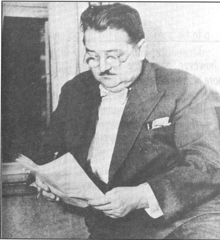
Alexander Woollcott, the inspiration for Hart and Kaufman's Sheridan Whiteside, the eccentric critic and radio personality in The Man Who Came to Dinner .

By the time Kaufman & Hart had created The Man Who Came To Dinner in 1939, America had experienced its first full flowering of mass media. It serves as testament to Kaufman & Hart's instinctive understanding of Americans that they would choose a person such as Sheridan Whiteside--a renowned radio raconteur--as the central character of their play. The impact of radio on the imagination of ordinary Americans like the Stanleys was quite profound. Radio, advertising, and the mass circulation of magazines and the tabloid press all arrived in the 1920's and proceeded to explode during the ensuing decade. But with that explosion, a very 20th century brand of fame and our own complex responses to it were born.