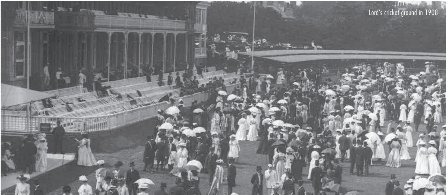
Lord's cricket ground in 1908

The Winslow Boy is set in an upper-middle class London household “at some period not long before the War of 1914-1918.” The Winslow family enjoys many of the comforts available to certain classes of society in this peaceful, prosperous time. However, as we listen to their conversations, we understand how they are affected by significant events that were transforming England during these years.