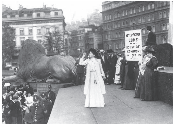
Christabel Pankhurst giving a speech asking suffragettes to 'rush' the House of Commons in October 1908

Across the Atlantic, the campaign for women's suffrage in America occurred almost simultaneously with that of England. American women won the right to vote with the 19th Amendment in 1920. •