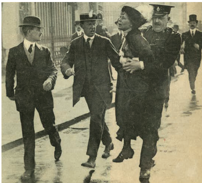
Woman suffragette getting arrested

To learn more, explore this interactive timeline on Women and the Vote in England: