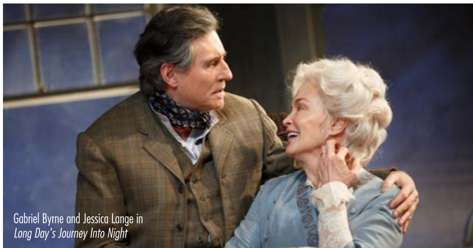
Gabriel Byrne and Jessica Lange in Long Day's Journey Into Night

Six years later, despite vowing not to have more children, Ella gave birth to her third son, Eugene. The birth was difficult, and she was given morphine for the resulting pain. This wasn't unusual at the time. Doctors had limited options for treating pain, and the prevailing belief that women were more delicate, and more sensitive to nervous upset, lead to widespread prescription of opiates for all gynecological ailments. In 1879 the president of the American Gynecological Society recommended that physicians teach women suffering menstrual pain to become "opium-eaters." Opiate-based over-the-counter remedies (including