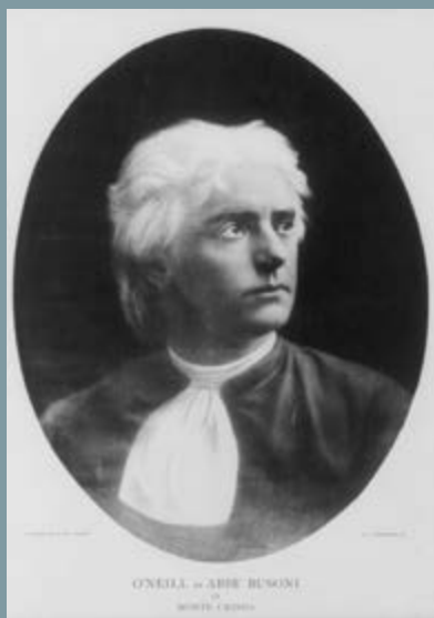
James O'Neill in The Count of Monte Cristo

In 1883, James first played Edmond Dantes in the melodrama The Count of Monte Cristo , based on Alexandre Dumas' novel. Over the next 30 years, he performed the role over 6,000 times and earned more than $800,000—a fortune for a man who started as a penniless immigrant. But it became a Faustian bargain: he had sold out artistic aspiration in exchange for financial security and felt trapped by the role. Still, he played Dantes until the production finally closed down in 1916. In 1920, with his self-esteem broken and his spirit destroyed, James O'Neill died of intestinal cancer. •