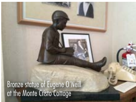
Bronze statue of Eugene O'Neill at the Monte Cristo Cottage

In Long Day's Journey Into Night , Edmund is home to spend the summer with his family after learning that he has contracted tuberculosis, or what was then known as "consumption."