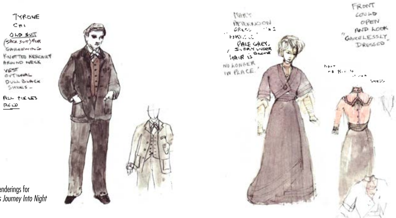
Costume renderings for Long Day's Journey Into Night