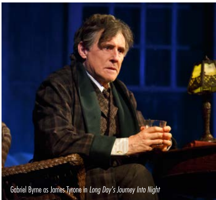
Gabriel Byrne as James Tyrone in Long Day's Journey Into Night

"My father died broken, unhappy, intensely bitter, feeling that life was a damned hard billet to chew. This after...what the mob undoubtedly regard as a highly successful career." - Eugene O'Neill