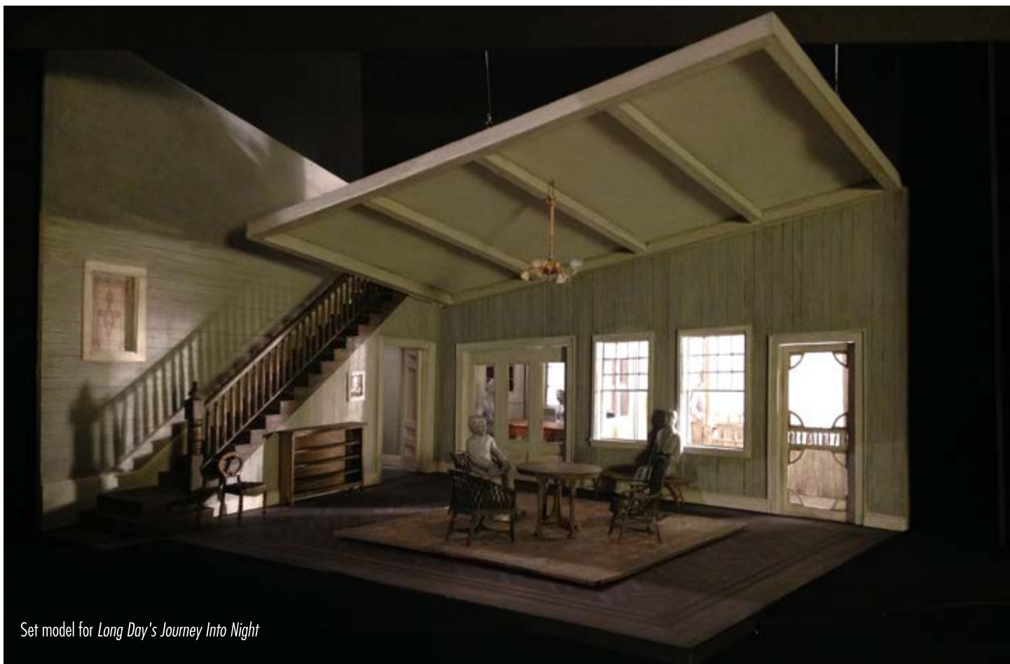
Set model for Long Day's Journey Into Night