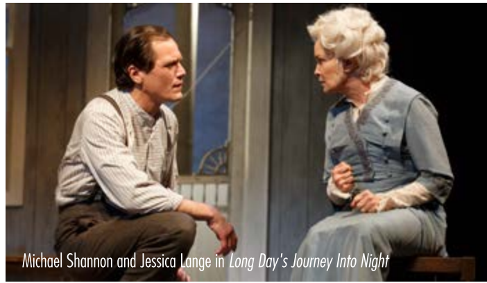
Michael Shannon and Jessica Lange in Long Day's Journey Into Night

James Sr. often accuses him of being in Long Day's Journey Into Night (he actually worked quite steadily at his father's company for a number of years), he was hardly a model performer. He often appeared onstage drunk and had a habit of inviting local prostitutes to watch his performances on the road.