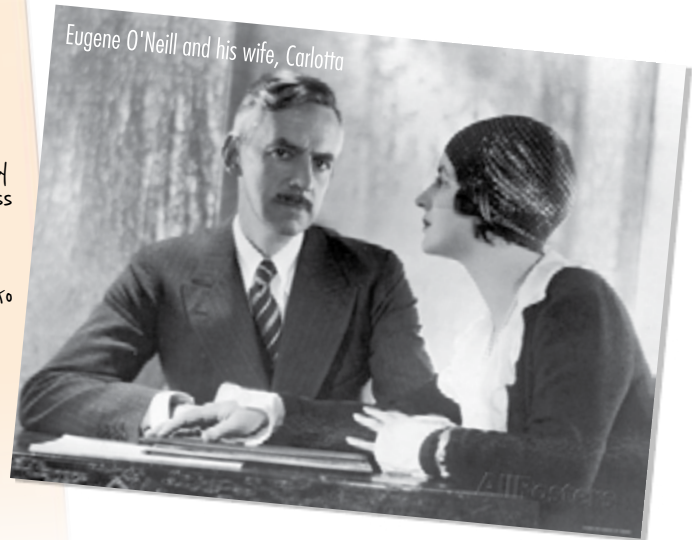
Eugene O'Neill and his wife, Carlotta

This dedication was written by Eugene O'Neill to his wife Carlotta Monterey when he gave her the script for what would become his masterpiece, Long Day's Journey Into Night . And the playwright's words make it immediately clear that this was not an easy script to write. While many of O'Neill's 38 plays contain elements taken from his own life, none would be as deeply autobiographical as this one—which is why its author was reluctant for it to ever see the light of day.