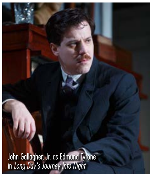
John Gallagher, Jr. as Edmund Tyrone in Long Day's Journey Into Night

TS: What do you look for from a director when rehearsing a role?