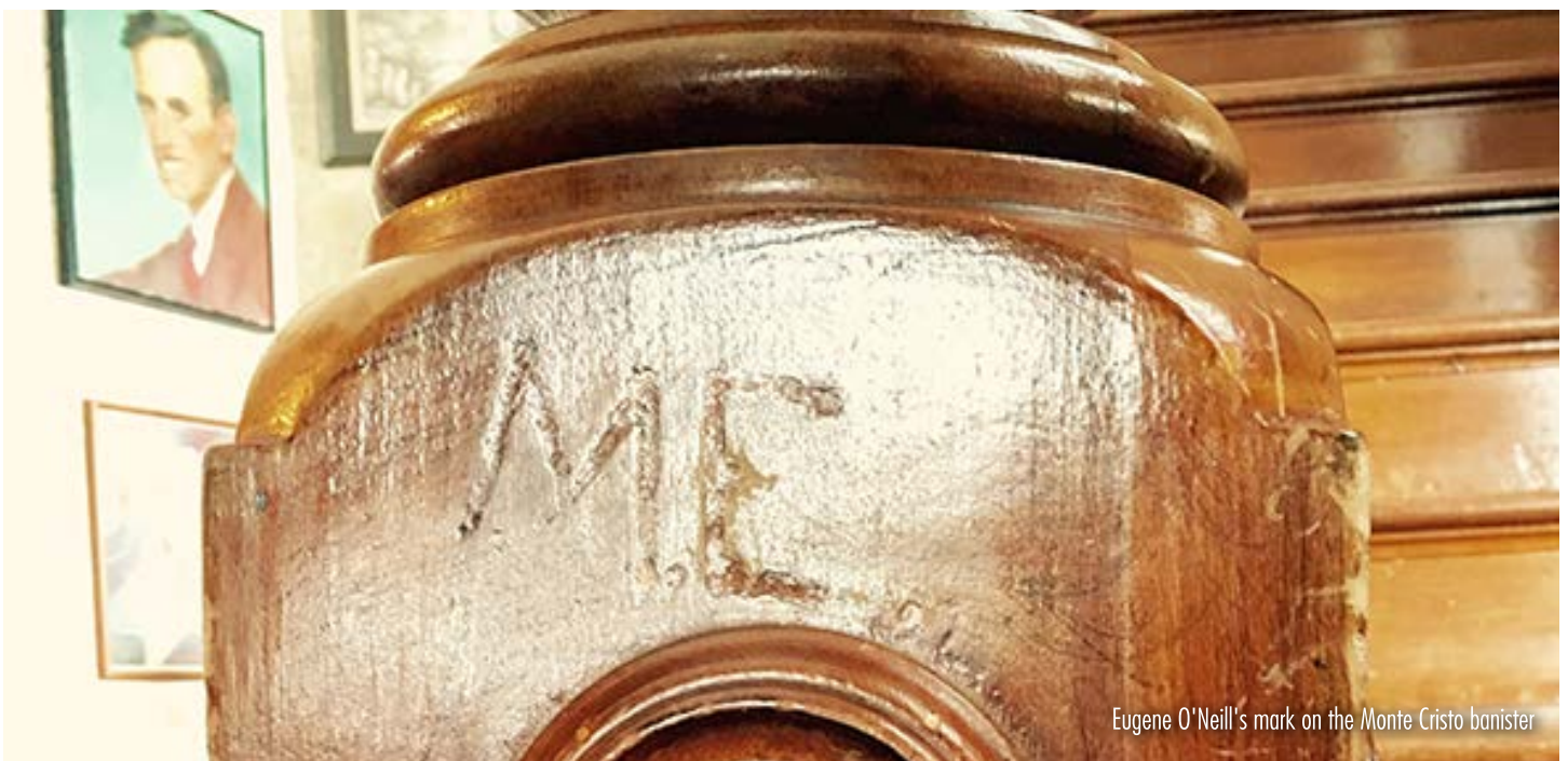
Eugene O'Neill's mark on the Monte Cristo banister

Almost every single play he wrote dealt with some kind of tragedy and came from a deeply personal place laced with pessimism. It would be fair to say that Eugene O'Neill didn't have a lot of hope for mankind, with one critic calling him "America's own apostle of woe." But audiences have embraced that woe, in the same way that terrible tragedies on stage moved the Greek playwrights whom O'Neill admired so greatly. Tragedy was not a new dramatic form, but it was reintroduced by O'Neill in a particularly American idiom. We can look with thanks to the legacy of Eugene O'Neill for the ways in which today's playwrights spill open their hearts on the stage, giving us the kind of vital and moving theatre that the man himself would have enjoyed. •