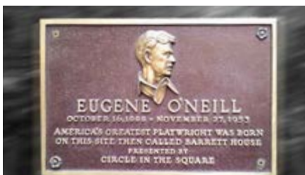
Plaque placed at Eugene O'Neill's birthplace, outside 1500 Broadway in New York City.

O'Neill also stirred within his friends a deep and intense loyalty. Gene's, as they referred to him, friends would shout his praises, such as from writer Stark Young who said of O'Neill's work, "at the heart of [the plays] we sense a pressure, a spasm of desire and sanity or torment and madness that leaves us swearing by the author, going to his aid." Beneath O'Neill's sometimes brutal face and mask of resigned sorrow would explode a broad smile. O'Neill would say, "I was just thinking of the past." And, after viewing or reading his plays, so were we. •