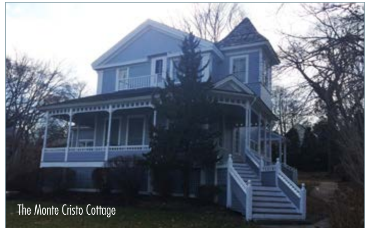
The Monte Cristo Cottage