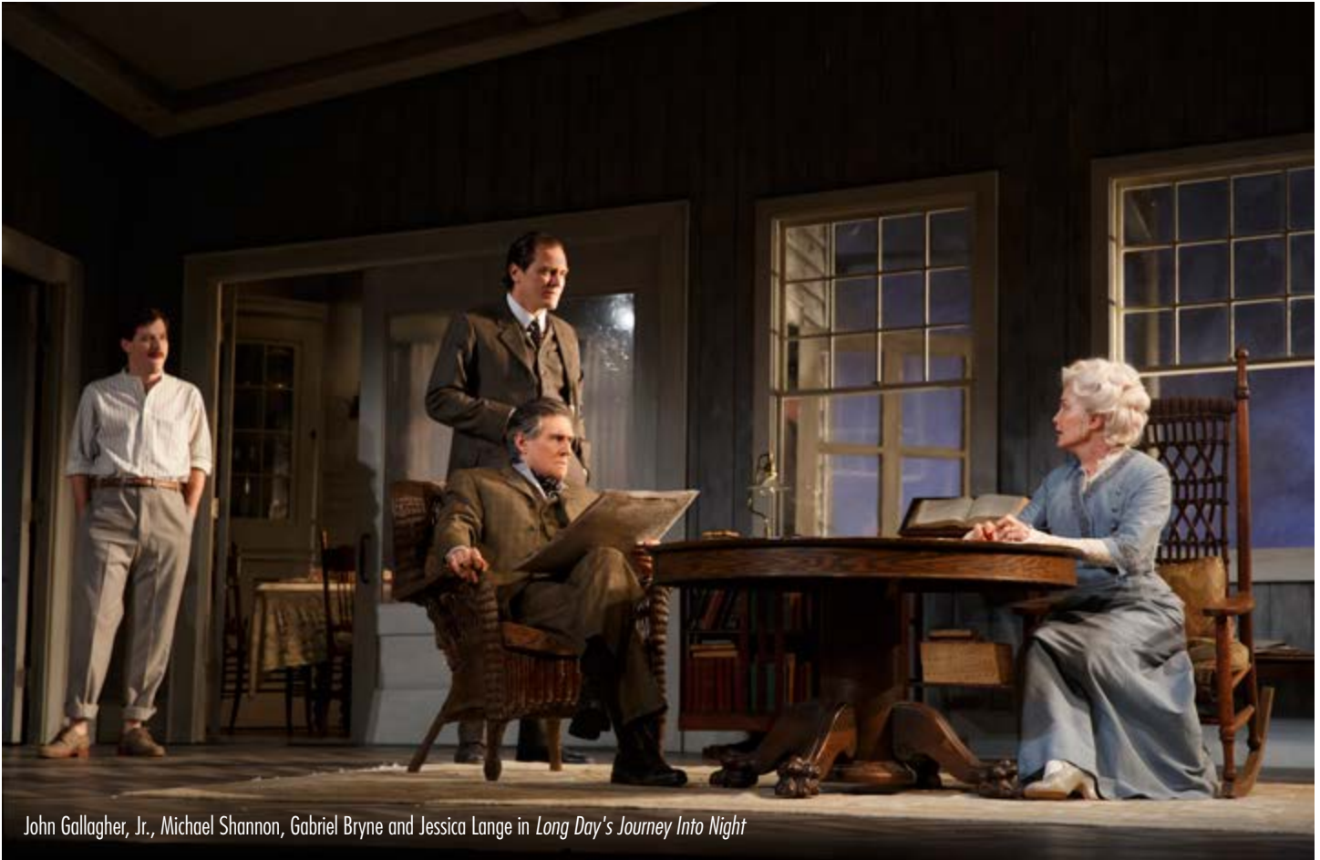
John Gallagher, Jr., Michael Shannon, Gabriel Byrne and Jessica Lange in Long Day's Journey Into Night

“It’s a claustrophobic, compulsive portrait of four people in a kind of hell, clinging to the edge of the world over the course of a single day.”