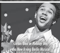
Corbin Bleu in Holiday Inn , the New Irving Berlin Musical