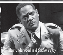
Blair Underwood in A Soldier's Play