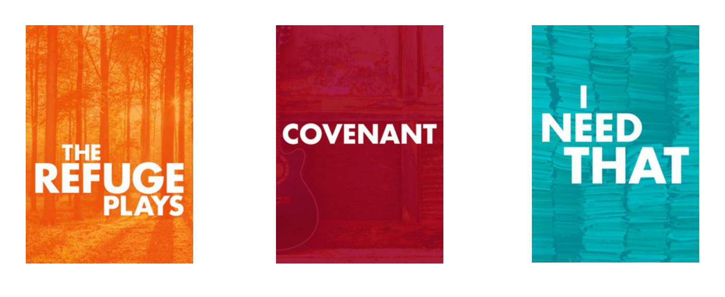
November 1, 2023 12:30pm