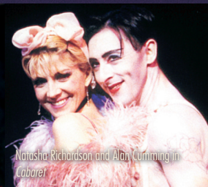
Natascha Richardson and Alan Cumming in Cabaret