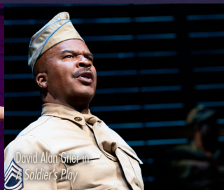
David Alan Grier in Soldier's Play