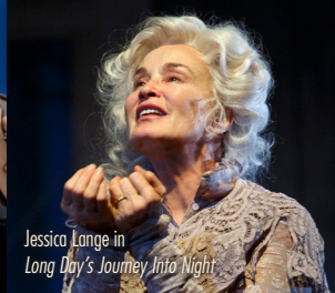
Jessica Lange in Long Day's Journey Into Night