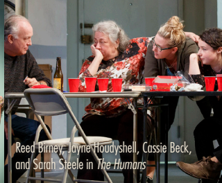
Reed Birney, Jayne Houdyshell, Cassie Beck, and Sarah Steele in The Humans