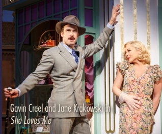
Gavin Creel and Jane Krakowski in She Loves Me