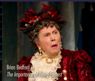
Brian Bedford in The Importance of Being Earnest