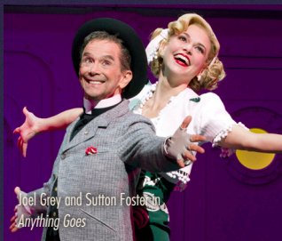
Joel Grey and Sutton Foster in Anything Goes