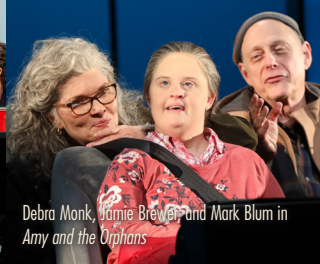
Debra Monk, Jamie Brewer, and Mark Blum in Amy and the Orphans