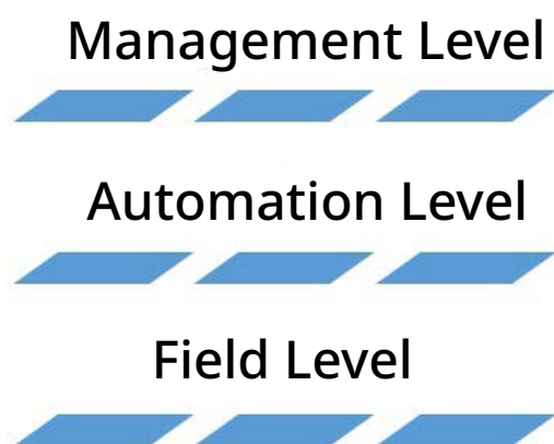
Fig. 3. Field, automation and management levels are the characteristic layers of a building automation system.

Field, automation and management levels are the characteristic layers of a building automation system. The automation functions are becoming increasingly decentralised with ever more powerful digital systems, integrated into the field level. Edge processing would be an analogy from today's industrial automation technology.