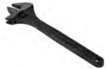
198-1685 18 inch 4007