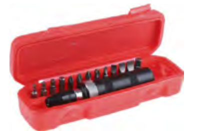
198-1749 15 piece set ID515