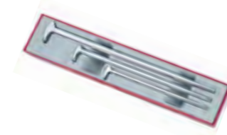
222-2994 12", 16", 20" pry bars TTXPB3