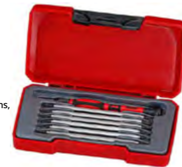
198-1860 8 Pieces TM708