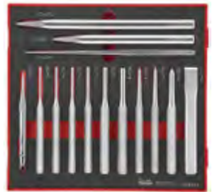
222-2970 14 piece set TEDPC14