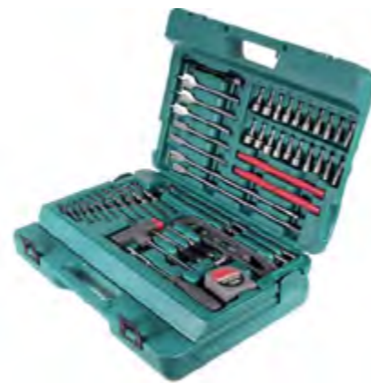
Makita 458-1913 P-44046 - 216 Piece