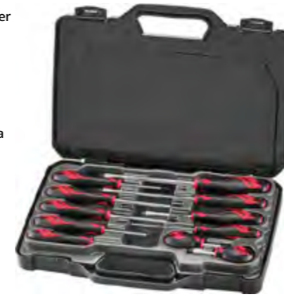
198-1852 11 Piece set MD911N