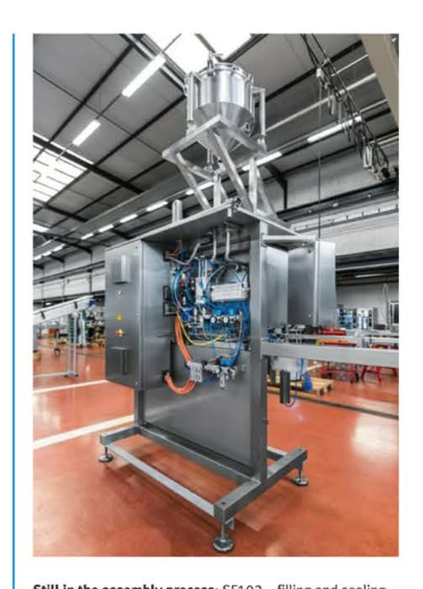
Still in the assembly process: SF102—filling and sealing system for Doypack® pouches with screw cap.