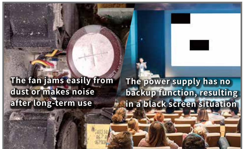
The fan jams easily from dust or makes noise after long-term use

Since the indoor LED display is close to the user, the requirements for noise, miniaturization, back up and power safety are relatively important. In response to market demand, MEAN WELL provides power solutions for small-pitch LED displays with the following features—