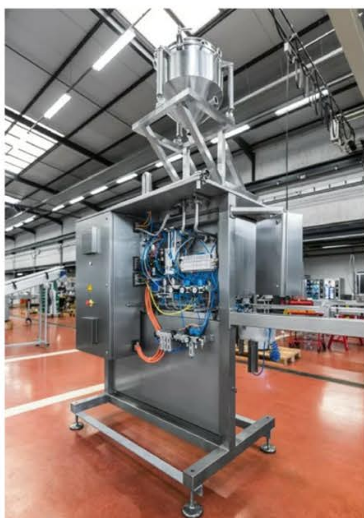
Still in the assembly process: SF102—filling and sealing system for Doypack® pouches with screw cap.

In 1963, Doyen obtained a patent for the stand-up pouch, propelling the company to specialize in filling and packaging technology for flexible materials. "Doypack® pouches represent the future of packaging. Manufacturers and consumers alike appreciate the numerous benefits of these high-quality stand-up pouches," stated Guinard. "The stand-up pouch serves as a powerful marketing tool, being lightweight, resealable, efficient for logistics, easy to handle, and visually appealing."