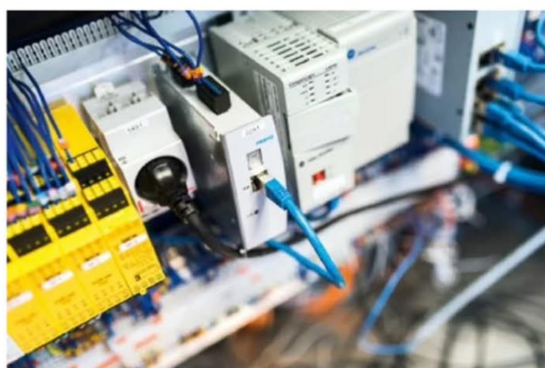
Small but beautiful: The controller CMMO controls the electric cylinder EPCO, connected via IO-Link®.

In addition, Festo's MS series service unit components, responsible for compressed air preparation, feature fine, ultrafine, and activated carbon food filters. These filters ensure direct contact with food, guaranteeing optimal food quality for Thimonnier's machines.